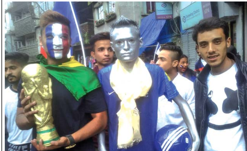
KURSEONG FOR FRANCE: Soccer fans in Kurseong town supporting France before the World Cup final on Sunday night took out a rally comprising for the French team fans. France was to take on Croatia for the Cup.