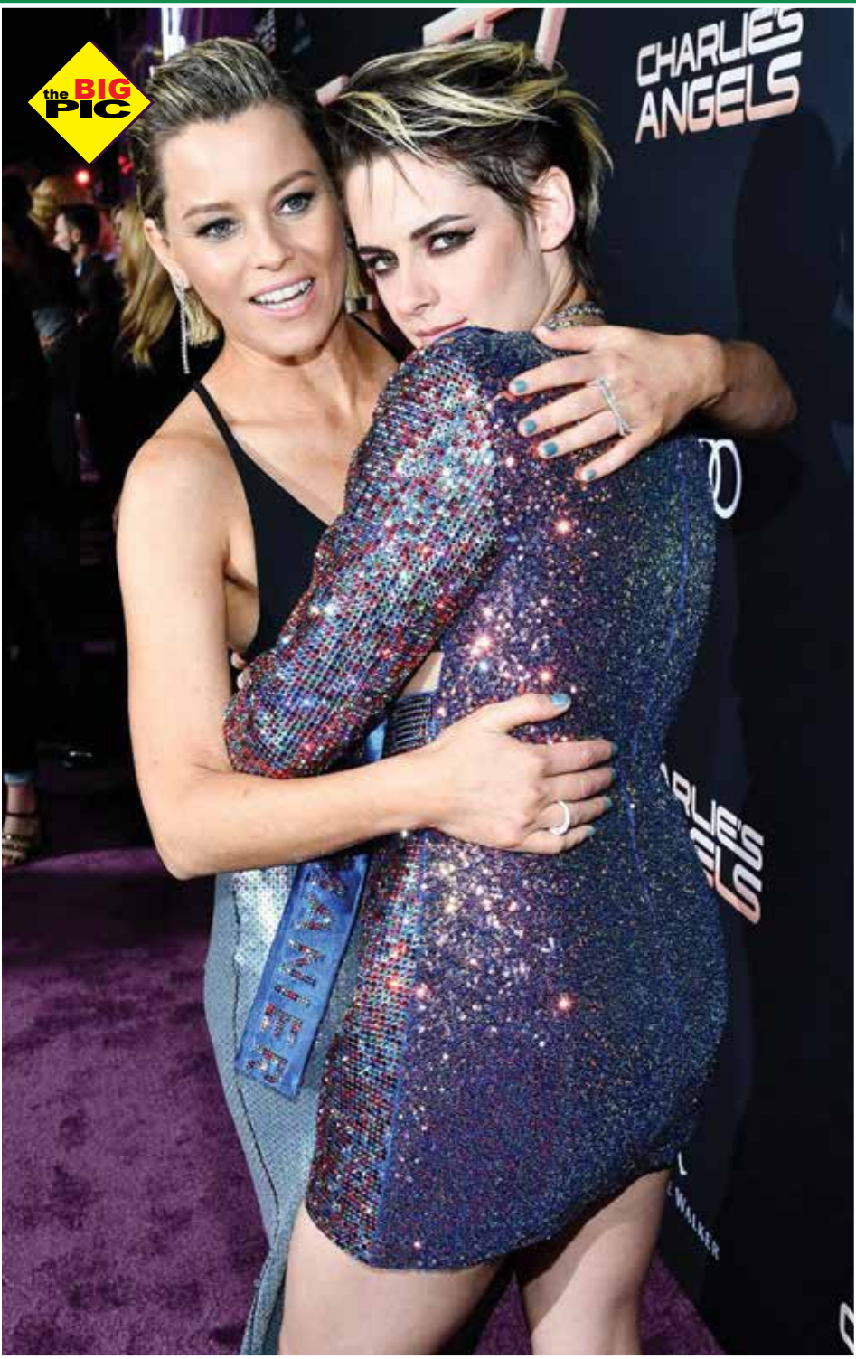
BOSLEY AND SABRINA! Elizabeth Banks and Kristen Stewart embraced at the premiere of Charlie's Angels, held at the Regency Village Theatre in Los Angeles.