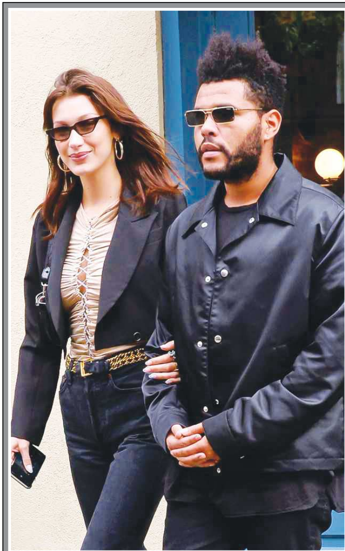
HAPPY B'DAY! Model Bella Hadid celebrates her birthday with The Weeknd in New York.

Chan is no stranger to animation world, having voiced Mr Feng in "The Nut Job 2: Nutty By Nature" and Master Monkey in "Kung Fu Panda" series.