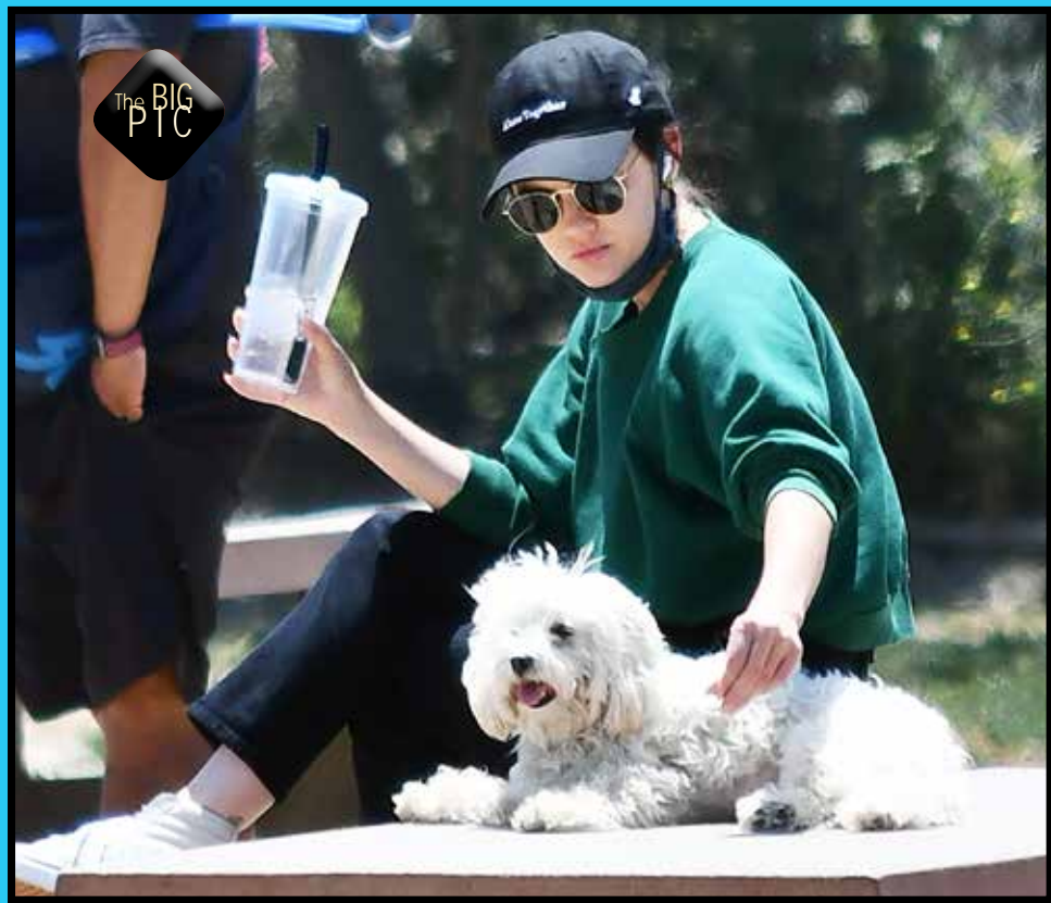
PUP AND THE PARK! Actress, Lucy Hale spent the afternoon at a park with her dog, Elvis, in Los Angeles.