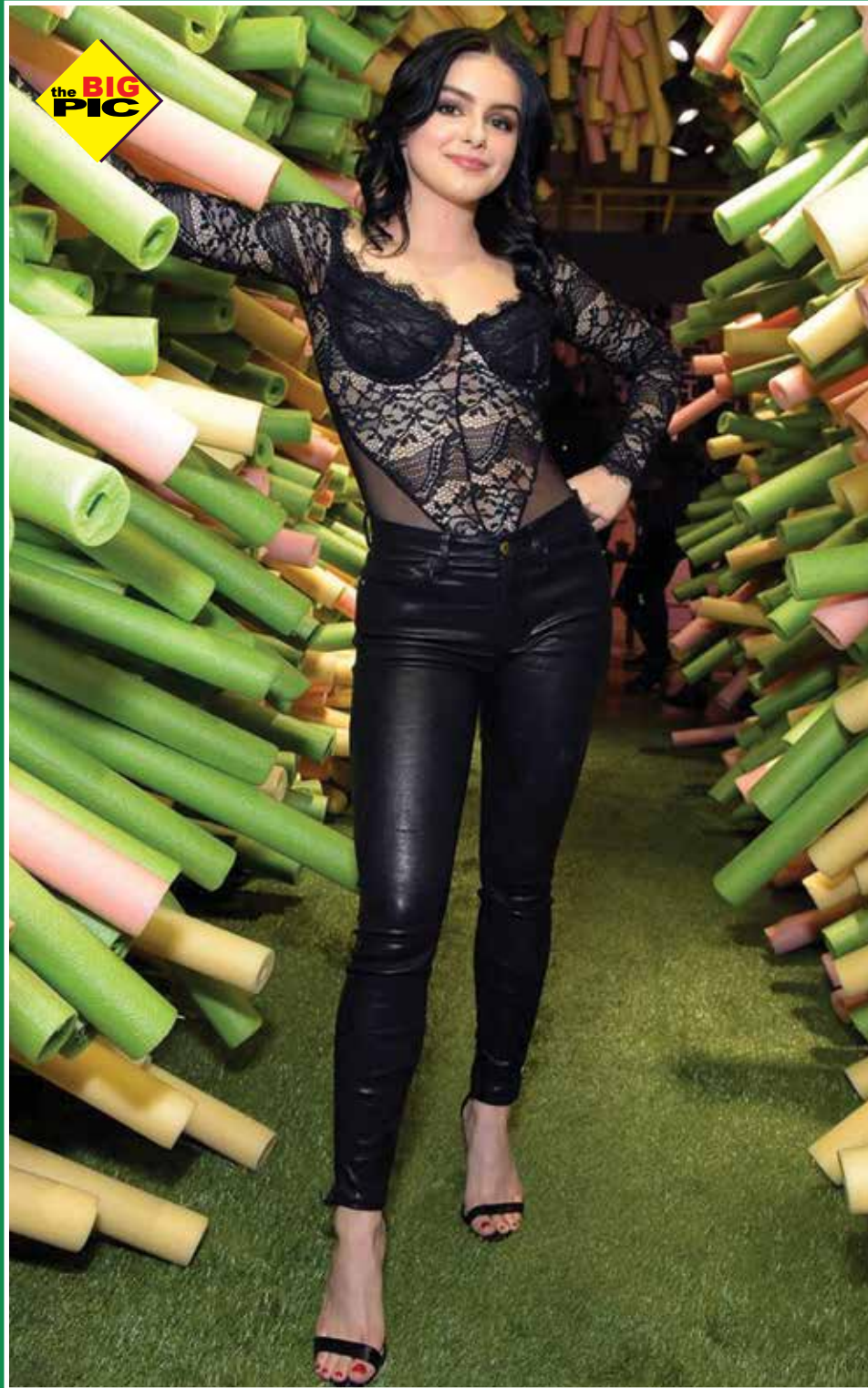
FUN HOUSE! The actress, Ariel Winter wears a lacey top paired with black pants at the VIP opening night for Dumpling & Associates pop-up art exhibition in Los Angeles.

Regular probiotics are most commonly linked to a healthy digestive tract and increased immune system support. Classen concluded that "if you drink just one of these [probiotic rich] beers every day it would be very good for you." Just don't go too far the other way as excessive drinking can damage the healthy bacteria in your gut.