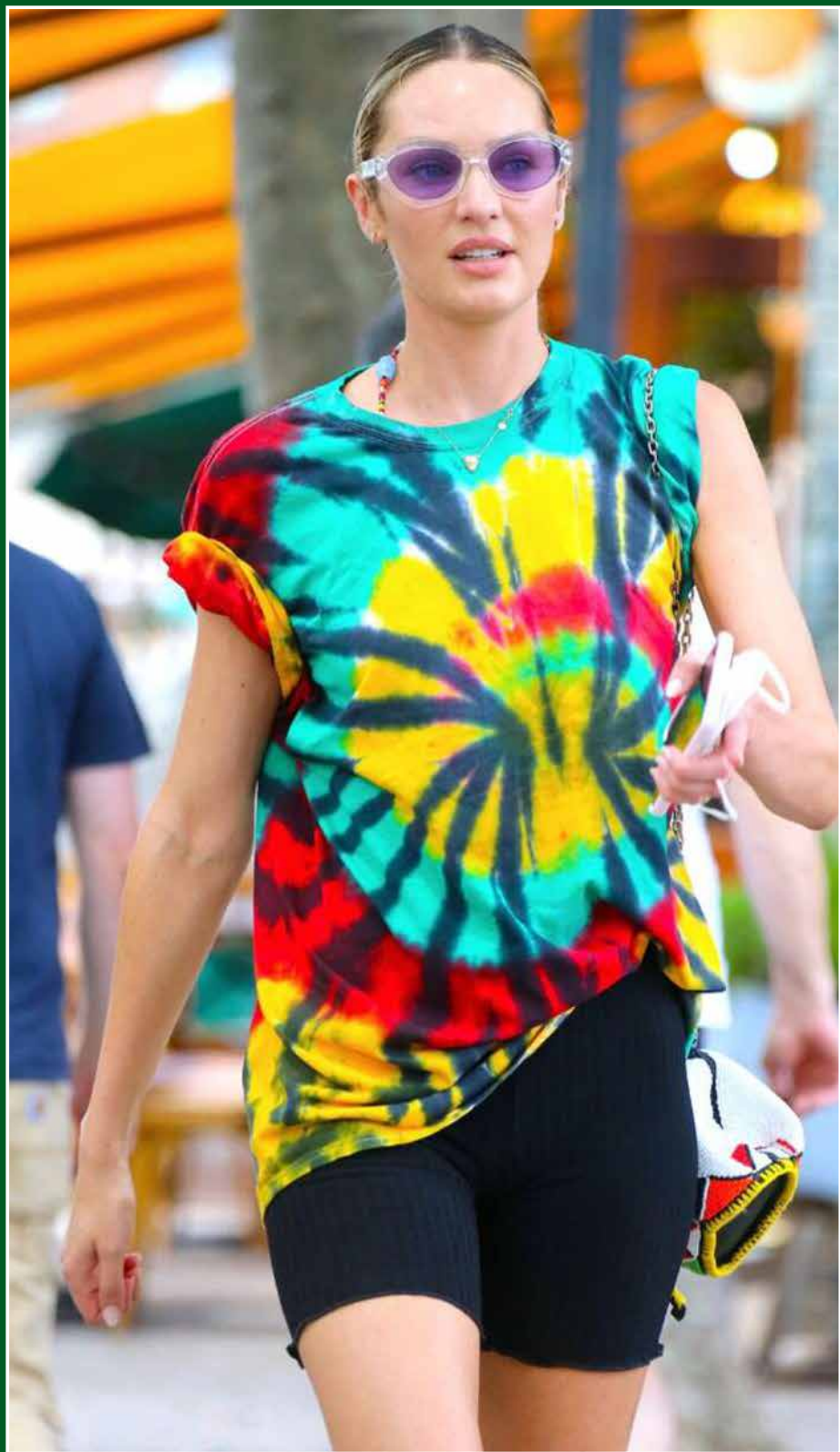
MODEL BEHAVIOR! The Victoria’s Secret Angel, Candice Swanepoel wears a colorful T-shirt while out walking with a friend in New York.