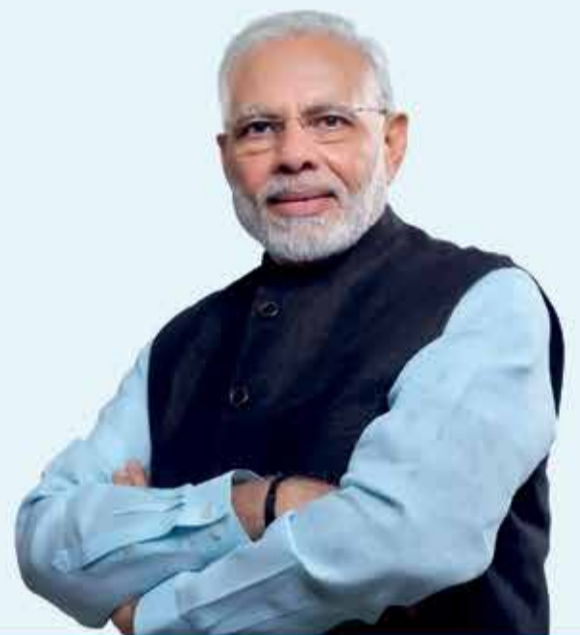
Narendra Modi Prime Minister