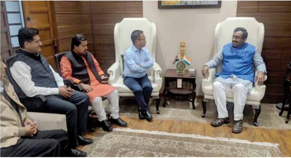
SKM President PS Tamang with BJP's NE in-charge Ram Madhav in New Delhi on Friday.

In an identical post on Facebook and Twitter, Madhav announced that the two parties joined