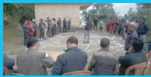
ANNUAL PLAN MEETING AT DIKCHU-ZANG AND LOWER RAKDONG pg02