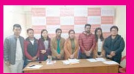
AGRI AND HORTI GRADUATES UPSET WITH ROUTINE RELAX- ATION OF SERVICE RULES pg03