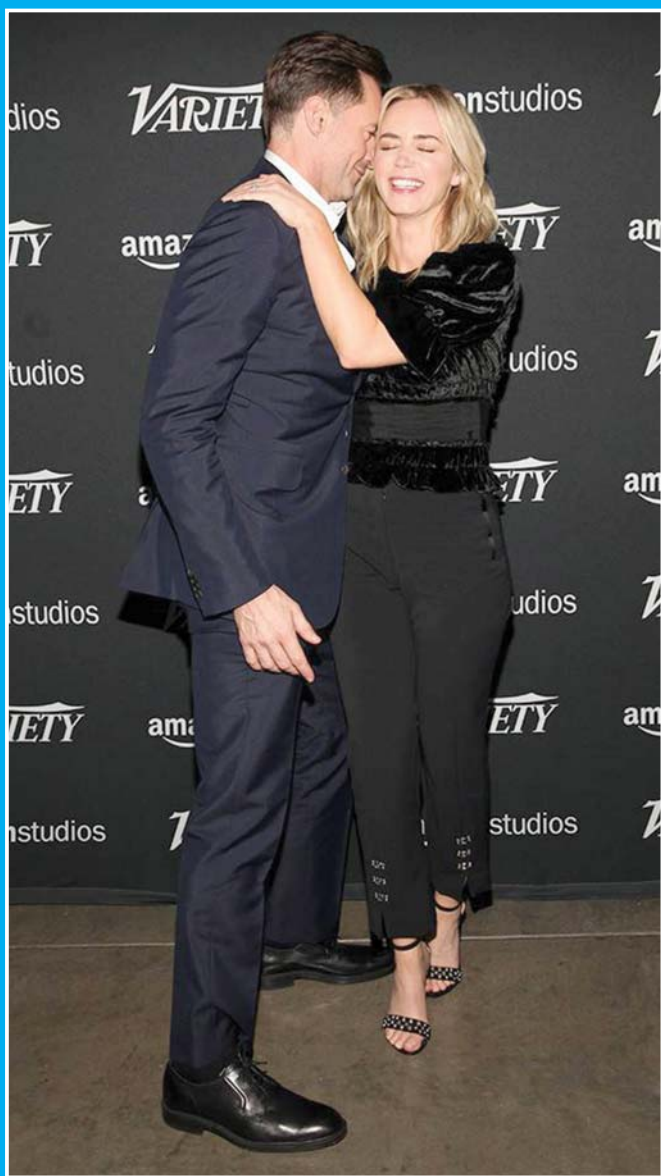
GIGGLES FOR DAYS! Hugh Jackman & Emily Blunt can't keep a straight face at the Variety Studio: Actors on Actors event.