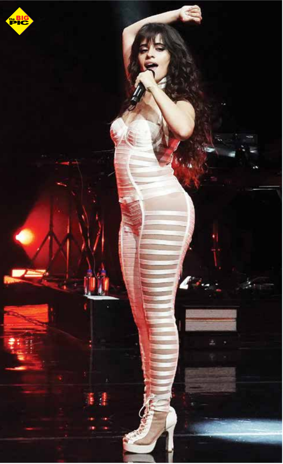
PRETTY SEÑORITA! Singer-songwriter, Camila Cabello wore a white cutout catsuit and lace up stilettos while performing at Jackie Gleason Theater at The Fillmore Miami Beach.

DEAR READERS, IF YOU ARE HAVING TROUBLE GETTING YOUR COPY OF THE SUMMIT TIMES IN YOUR NEIGHBOURHOOD, PLEASE MESSAGE OR WHATSAPP US YOUR NAME AND ADDRESS AT 9832556698 AND WE WILL ENSURE THAT THE NEWSPAPER REACHES YOU.