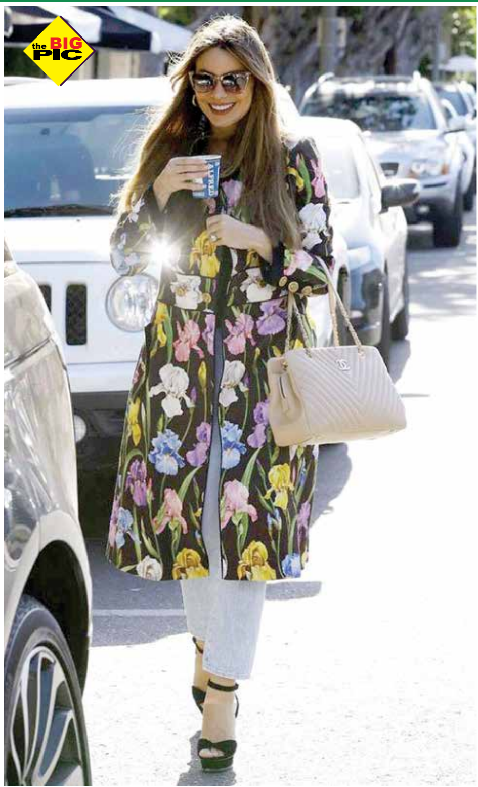
FEELIN' FLORAL! The actress, Sofia Vergara has spring fever wearing a coat covered in flowers in West Hollywood.