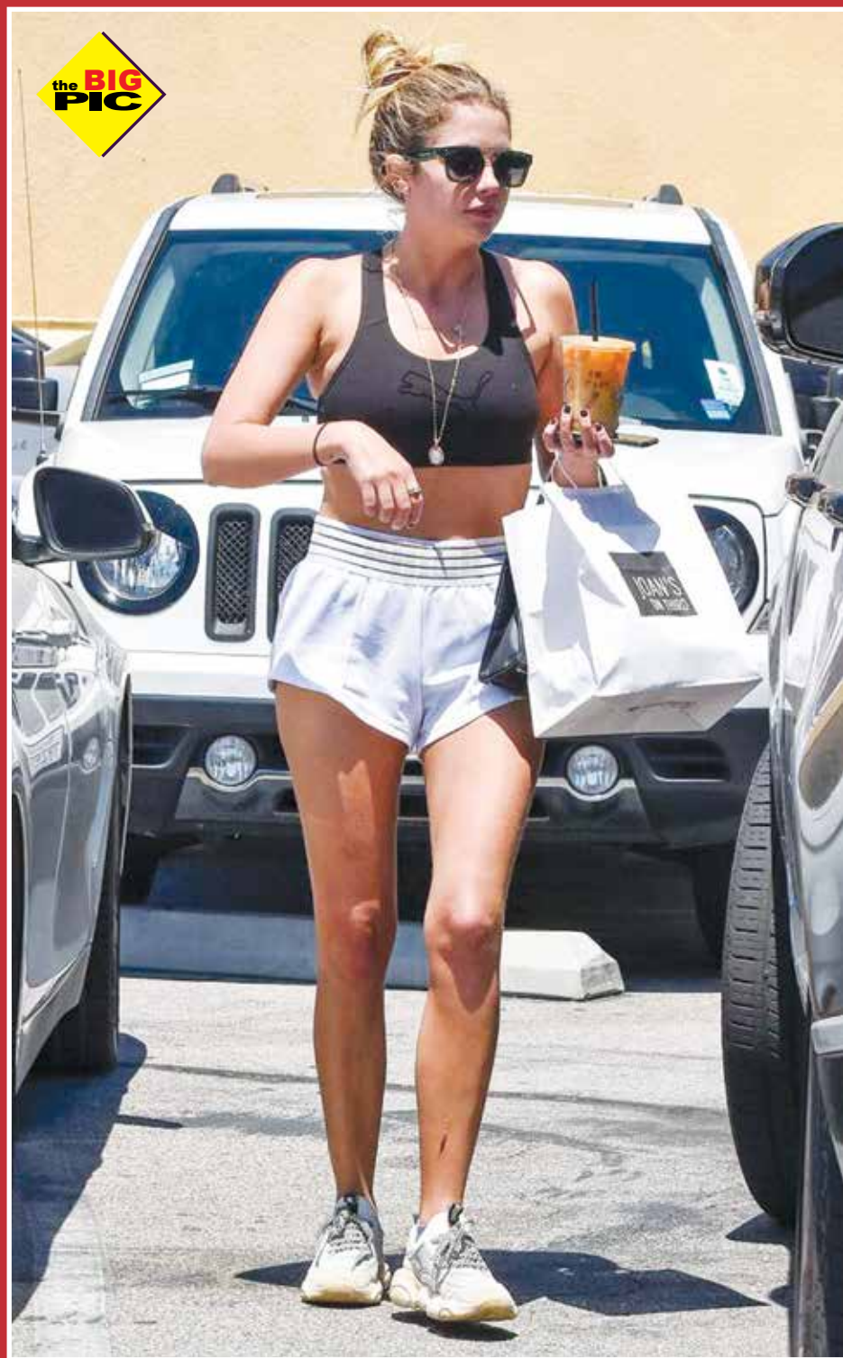
TO GO! The Pretty Little Liars, Ashley Benson grabs takeout for lunch in Los Angeles.