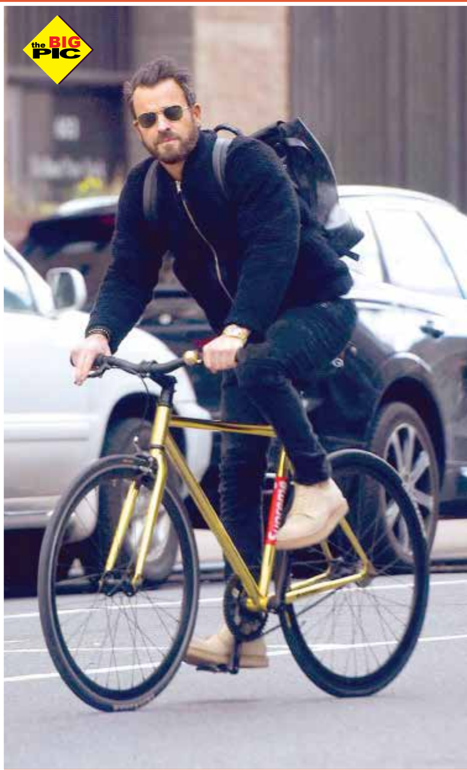
ROLLING AROUND! The actor, Justin Theroux bikes his way through the streets of NYC.