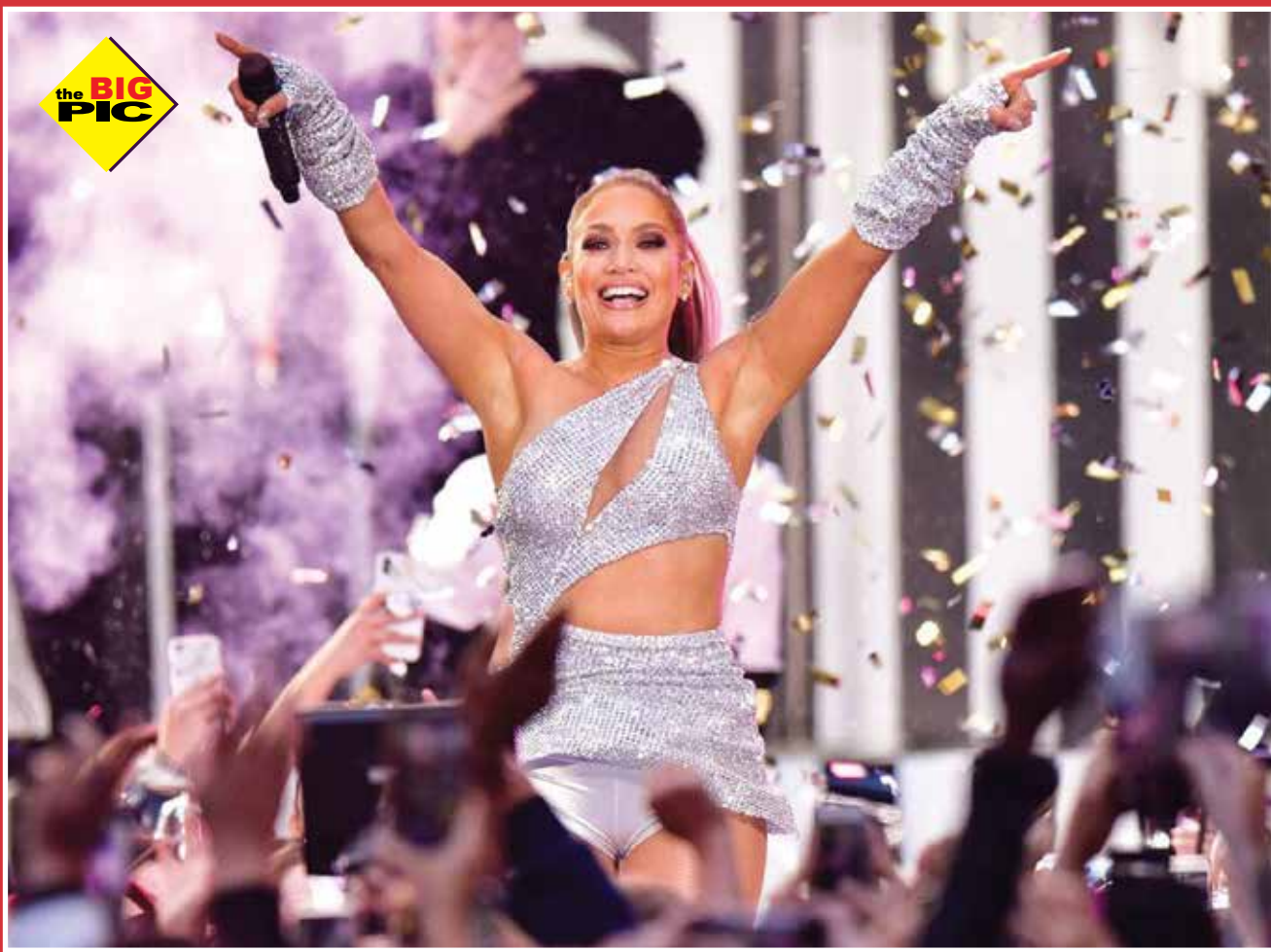
PARTY TIME! The music star, Jennifer Lopez, who is set to begin her It's My Party tour, performs a concert on Today in NYC.