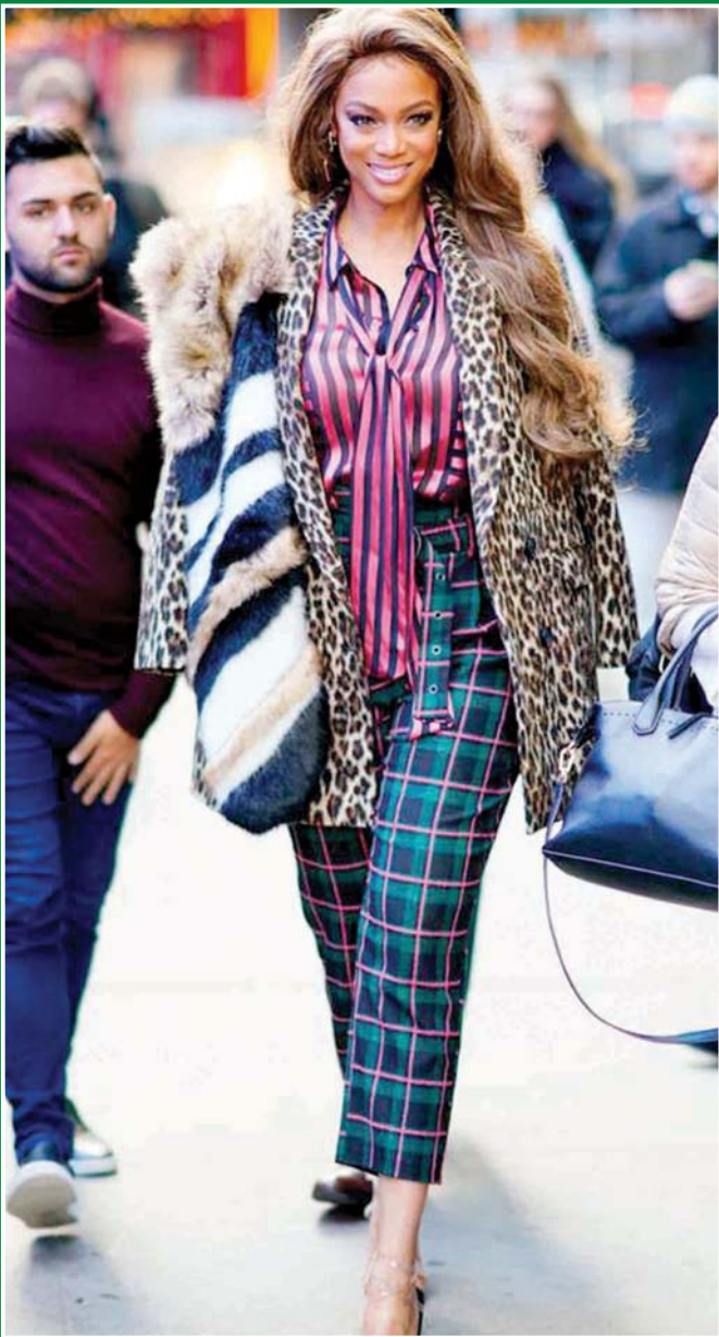
COOL STYLE! Model Tyra Banks mixes all the prints during a day out in The Big Apple.