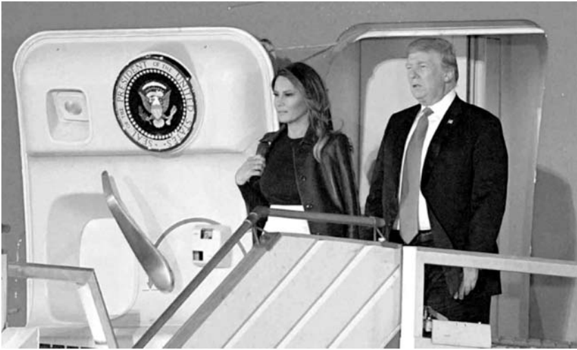
Buenos Aires on Friday.

German Chancellor Angela Merkel was to miss the summit's opening after her plane was forced to make an emergency landing in Cologne due to what she called a "serious" a technical problem. She eventually took off on a flight from Madrid bound for