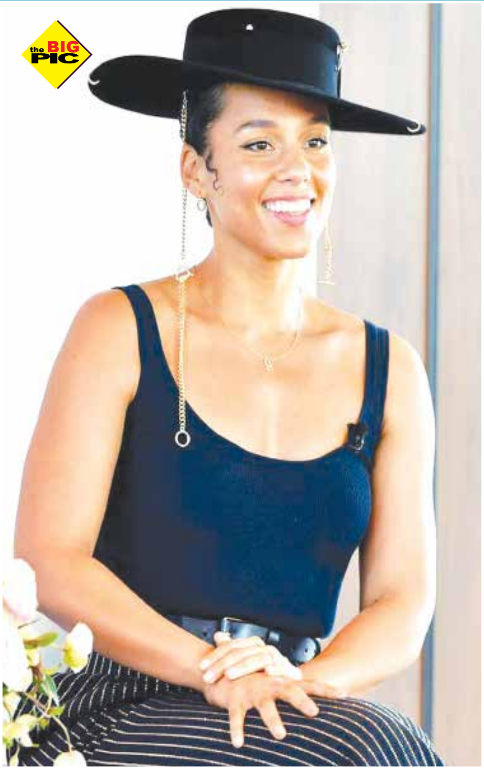
SO CHIC! The singer, Alicia Keys looks super stylish as she speaks onstage at the Billboard x Amex Impact Brunch in West Hollywood.