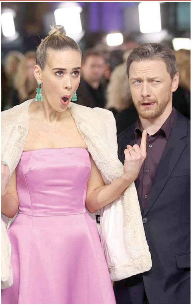
FUNNY FACES! The Glass co-stars, Sarah Paulson & James McAvoy, share a hilarious moment at the film's red carpet premiere in London, England.