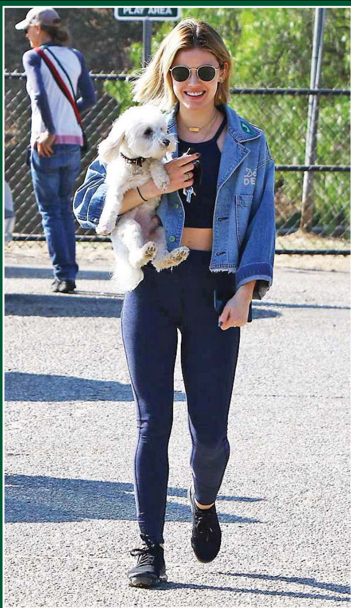
PERFECT PUP! Actress Lucy Hale takes her dog to the park during a sunny day in L.A.