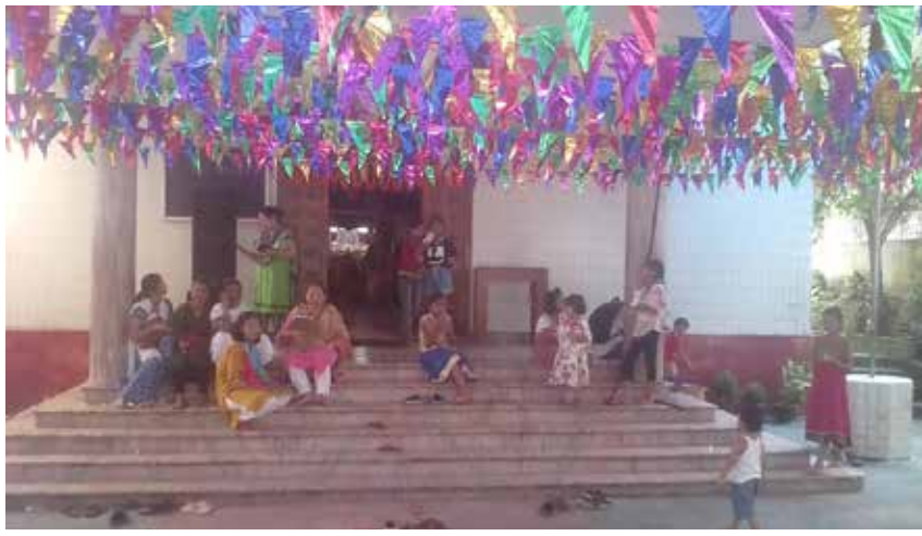
JANAMASHTAMI AT SINGTAM: Devotees gathered at the Pranami Mandir at Singtam bazaar today to offer prayers to Lord Krishna on the occasion of Janmashtami.