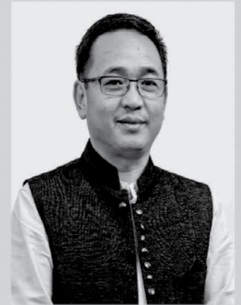
Shri Prem Singh Tamang Hon'ble Chief Minister

Trailing the colours of the National Flag, let us stand together for unity, prosperity and peace.