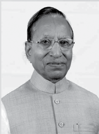
Shri Ganga Prasad Hon'ble Governor