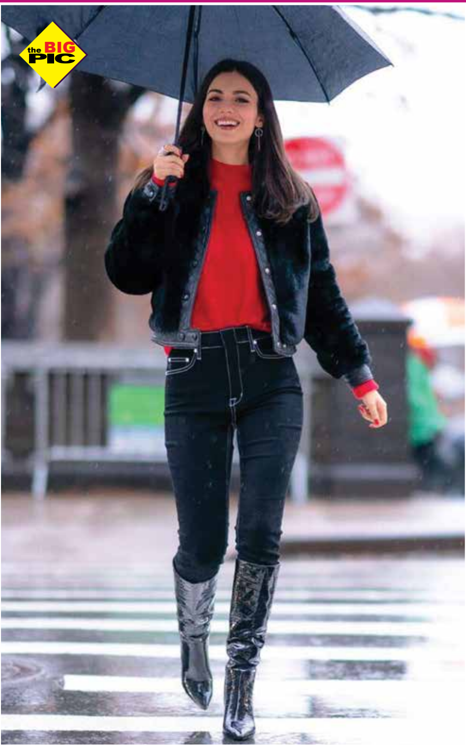
RAINY DAY GLOW! The star, Victoria Justice doesn't let the grey skies prevent her smiles during a walk through Midtown, NYC.