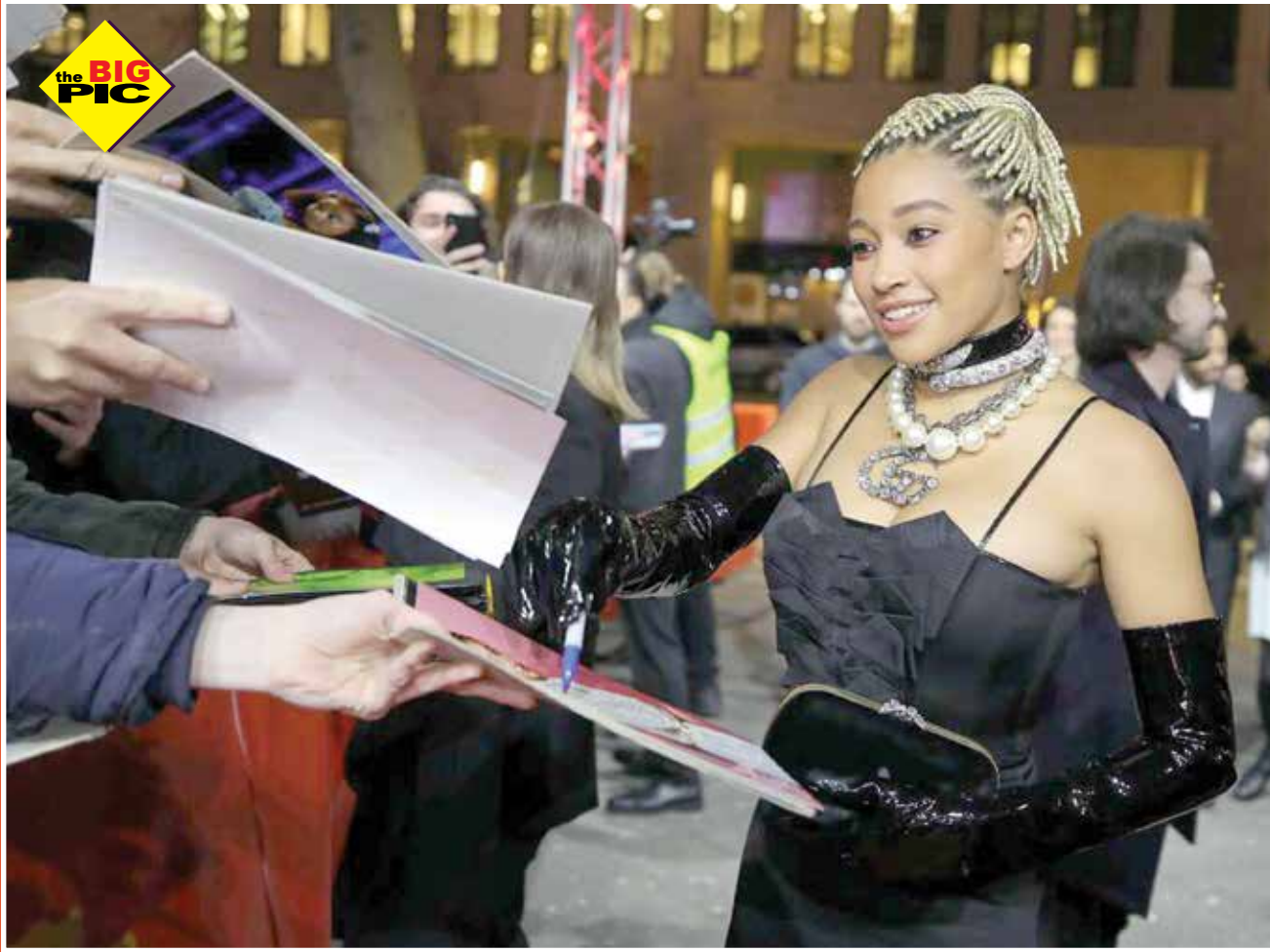
FAN FAVORITE! The actress, Amanda Stenberg signs autographs as she arrives at the premiere of her new movie The Eddy during the Berlin Film Festival in Germany.