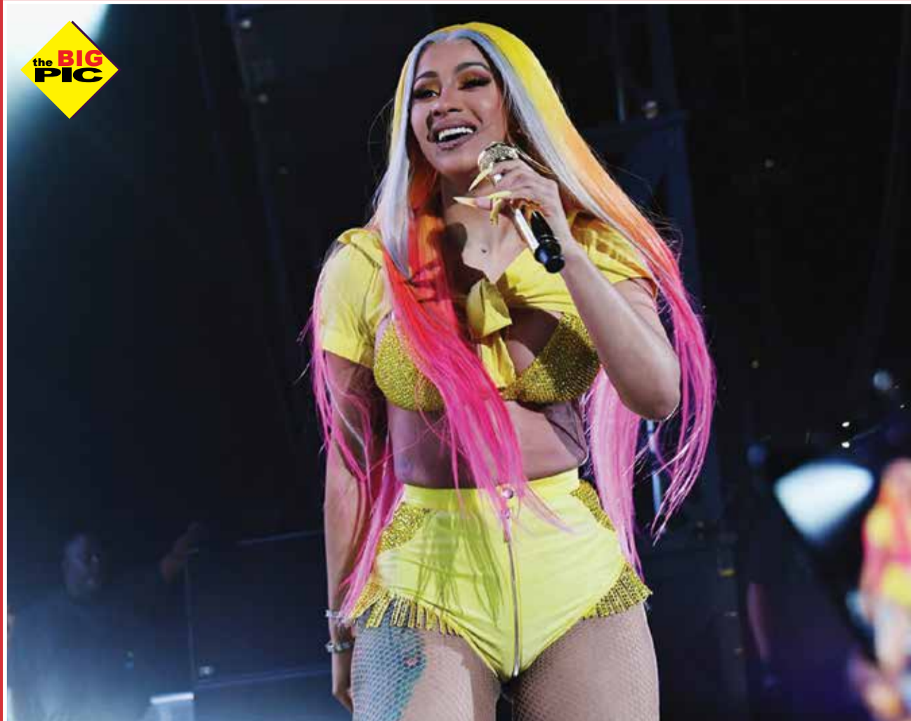
COLOFUL CARDI! The “Bodak Yellow” singer, Cardi B gets festive performing at the Summer Jam 2019 in East Rutherford, New Jersey.