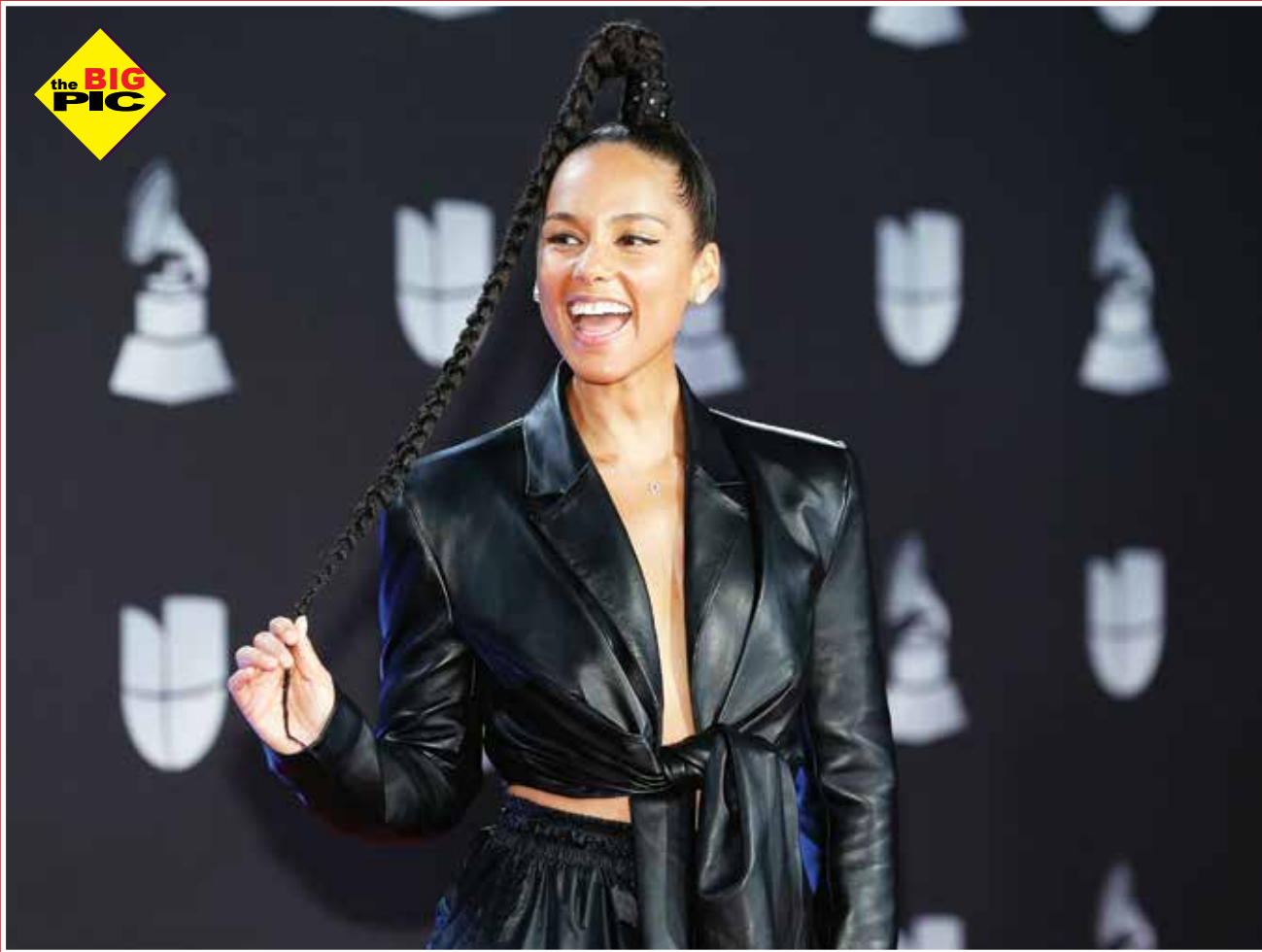
ANIMATED ALICIA! Singer, Alicia Keys arrived at the 20th Latin Grammy Awards, held at the MGM Grand Garden Arena in Las Vegas.