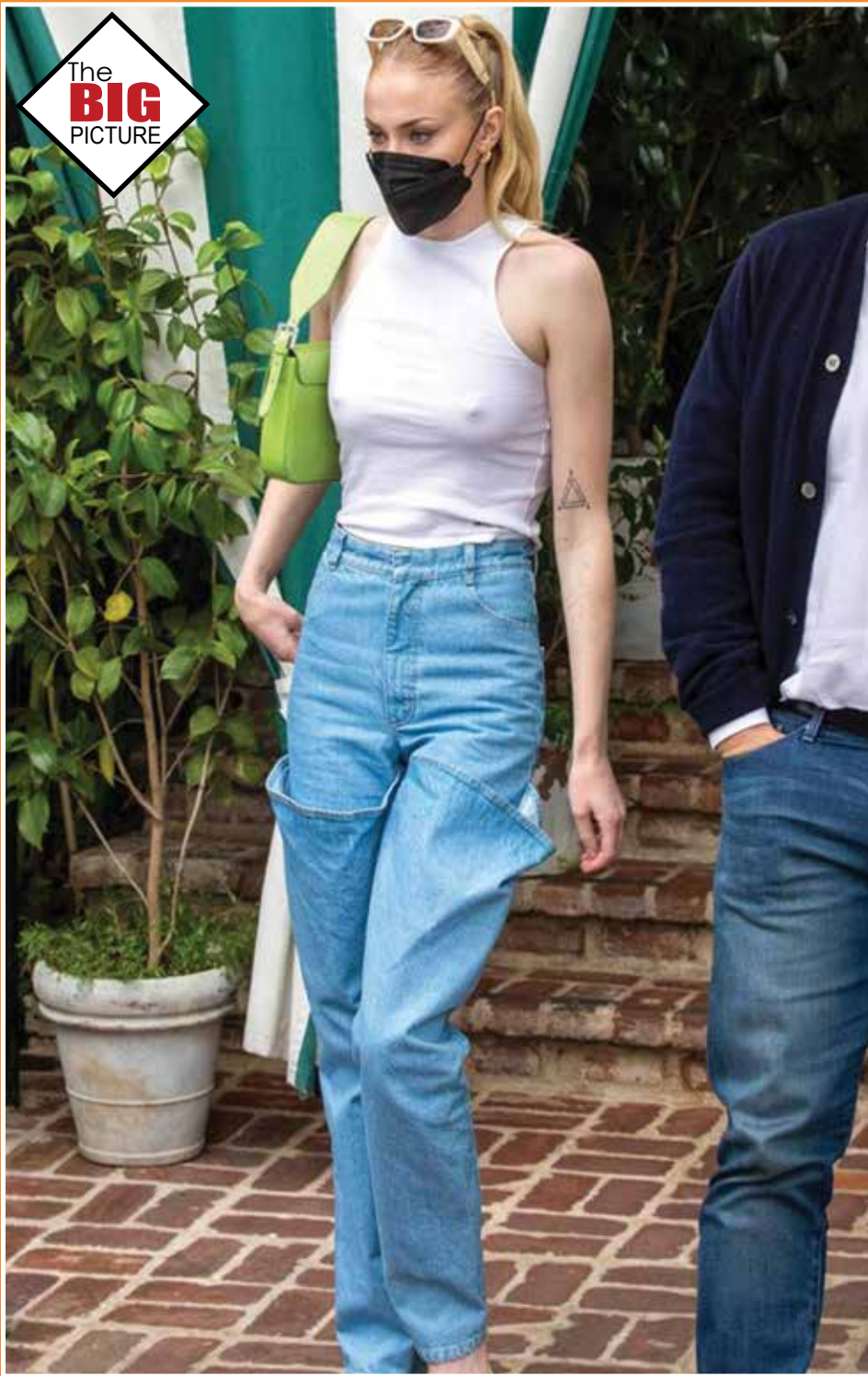
AND THAT'S THE TEA! The Games of Thrones actress, Sophie Turner enjoys a lunch date with hubby Joe Jonas at San Vicente Bungalows in LA.