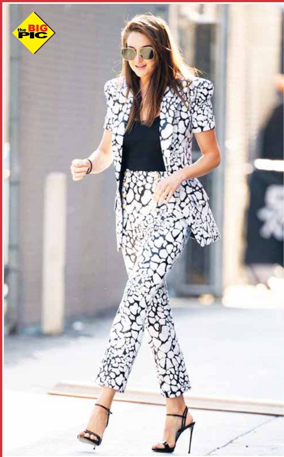
LOOKING SHARP! The Big Little Lies star, Shailene Woodley styles a black and white pant suit while out in Los Angeles.