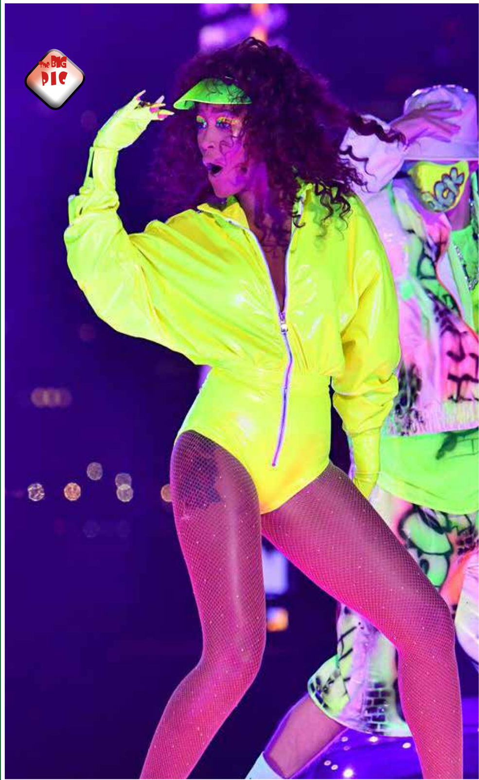
SHAKE IT! The MTV VMA host, Keke Palmer does double duty performing at the Skyline Drive-In during the award show.