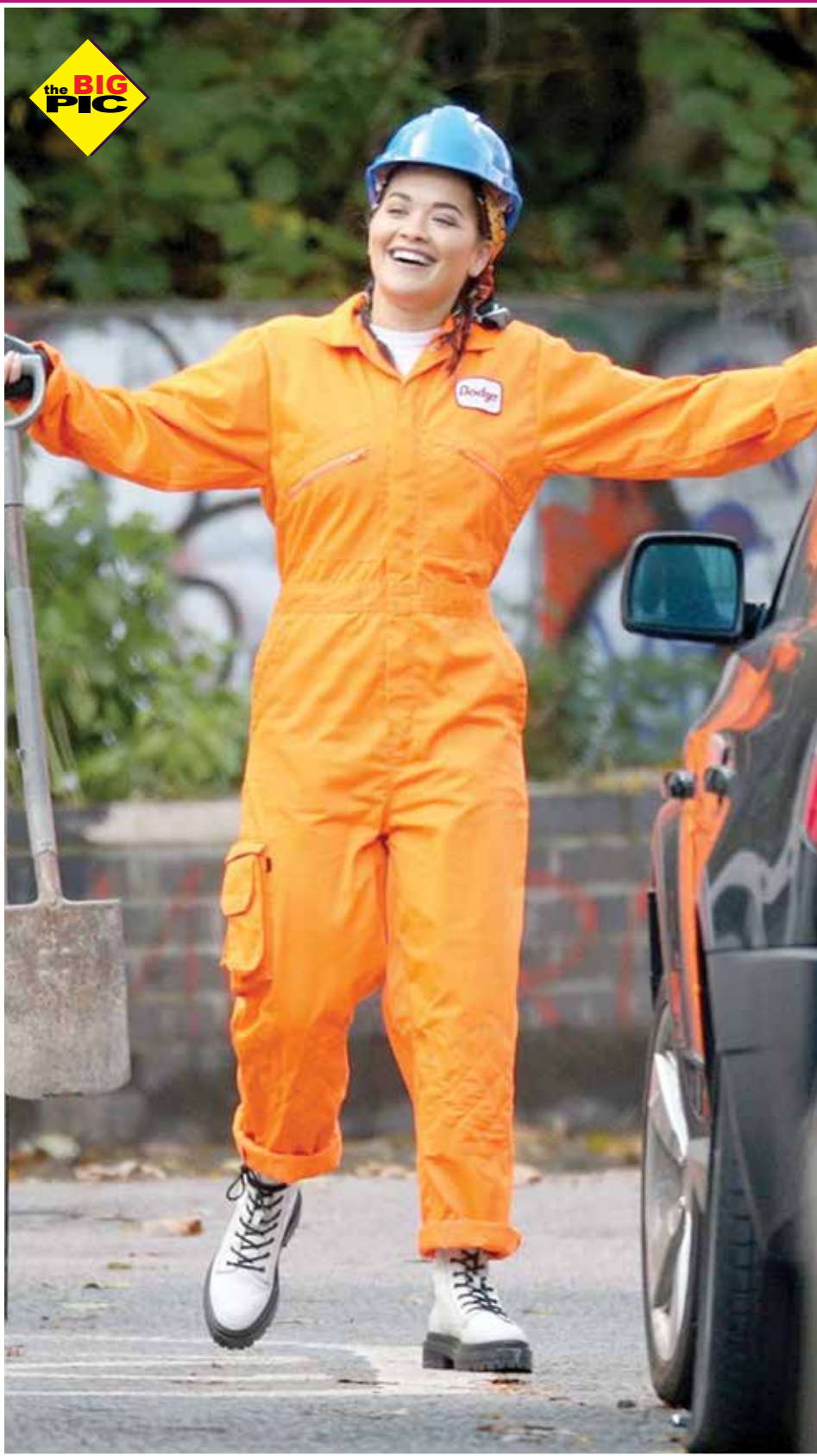
BEHIND THE SCENES! The singer, Rita Ora dresses as a construction worker on the set of Twist in London.