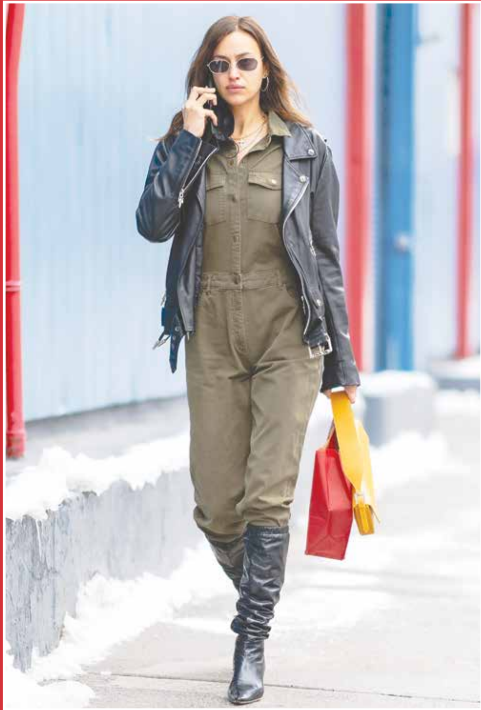
MAKING COLD WEATHER FASHIONABLE! Model Irina Shayk wore an olive jumpsuit from sustainable denim brand DL1961 while out and about in New York.