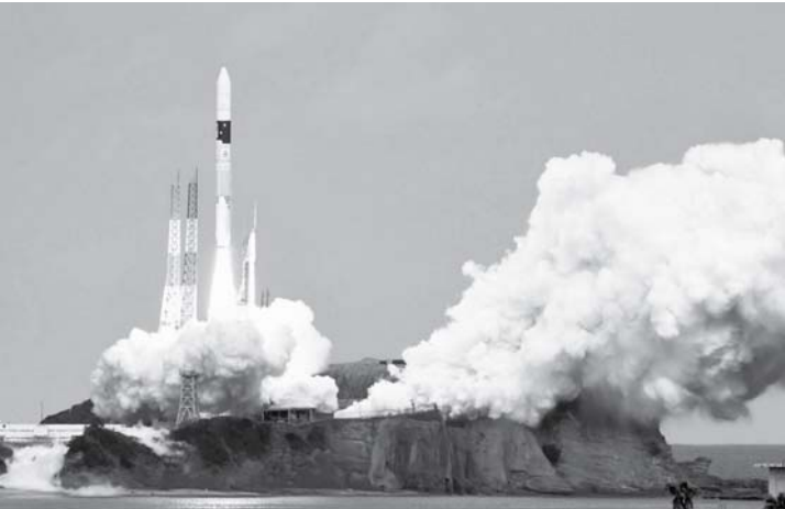
and scientists hope samples taken from the asteroid will offer clues about what gave rise to life on Earth. JAXA's announcement came just days before the

Ryugu is thought to contain relatively large amounts of organic matter and water, the stuff of life,