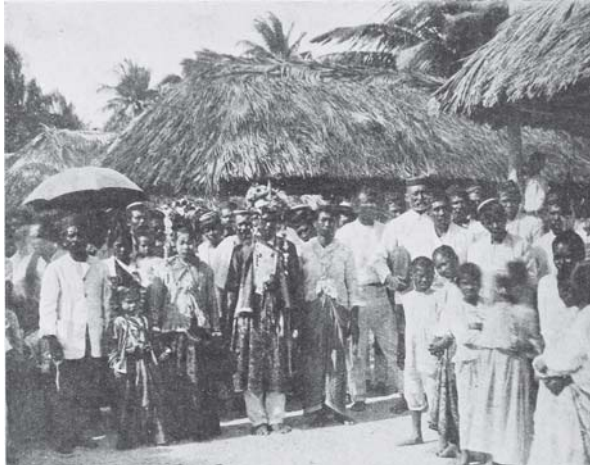
Cocos Malay photo from the 1910s showing a wedding procession that is still practised today with the groom pictured going to the bride's house accompanied by members of the community.

Obtaining "Indigenous" status also usually requires local groups to