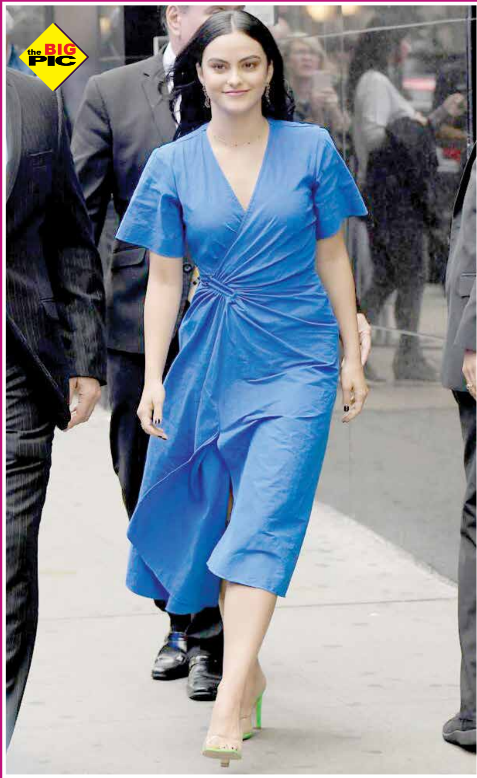
GORGEOUS IN BLUE! The Riverdale star, Camila Mendes looks electrifying in a wrap dress paired with lime green heels while out in New York City.