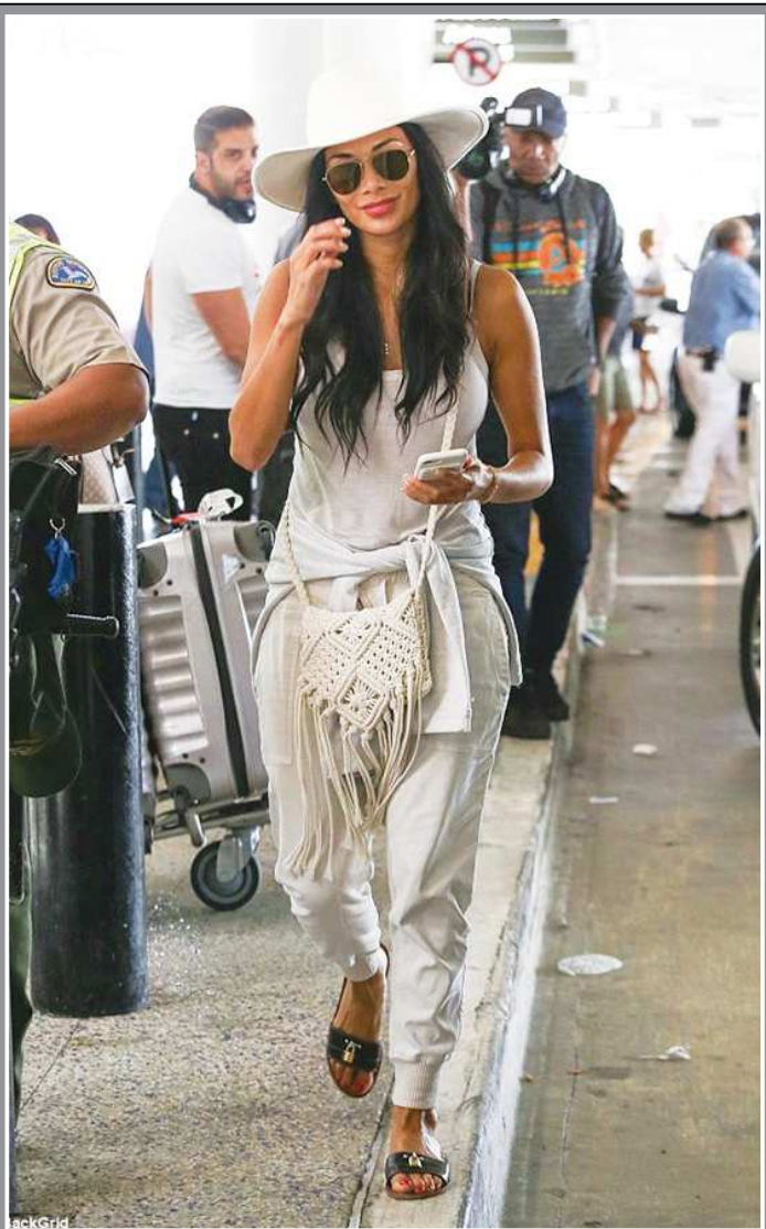
JUST LANDED! Nicole Scherzinger is end-of-summer chic in an all-white ensemble as she lands at LAX.