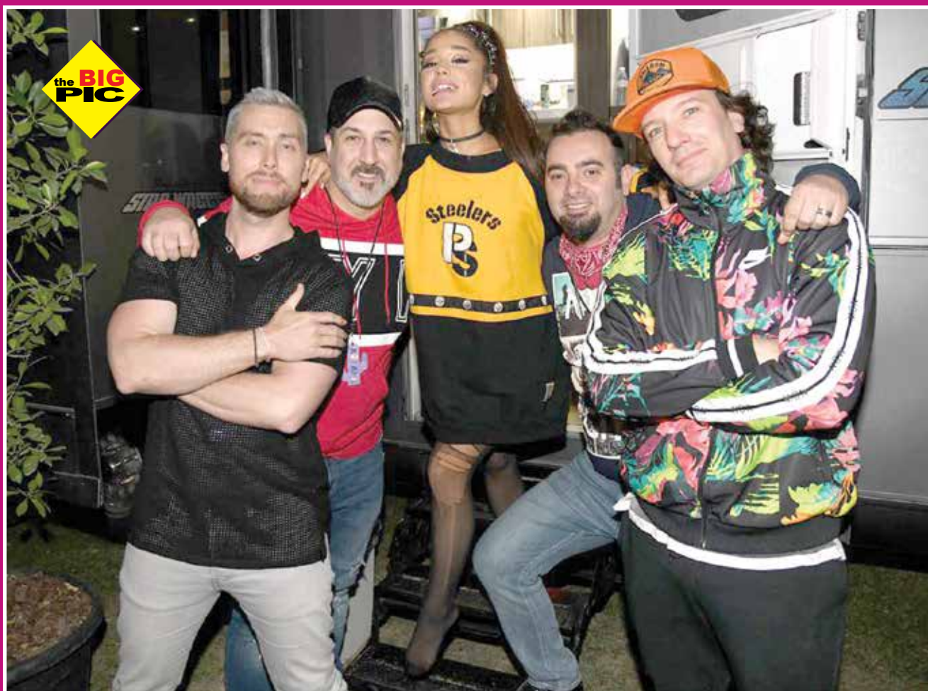
SWEET COLLAB! The pop artists, Ariana Grande & NSYNC poses together to close out with an outstanding performance at the Coachella Valley Music and Arts Festival.