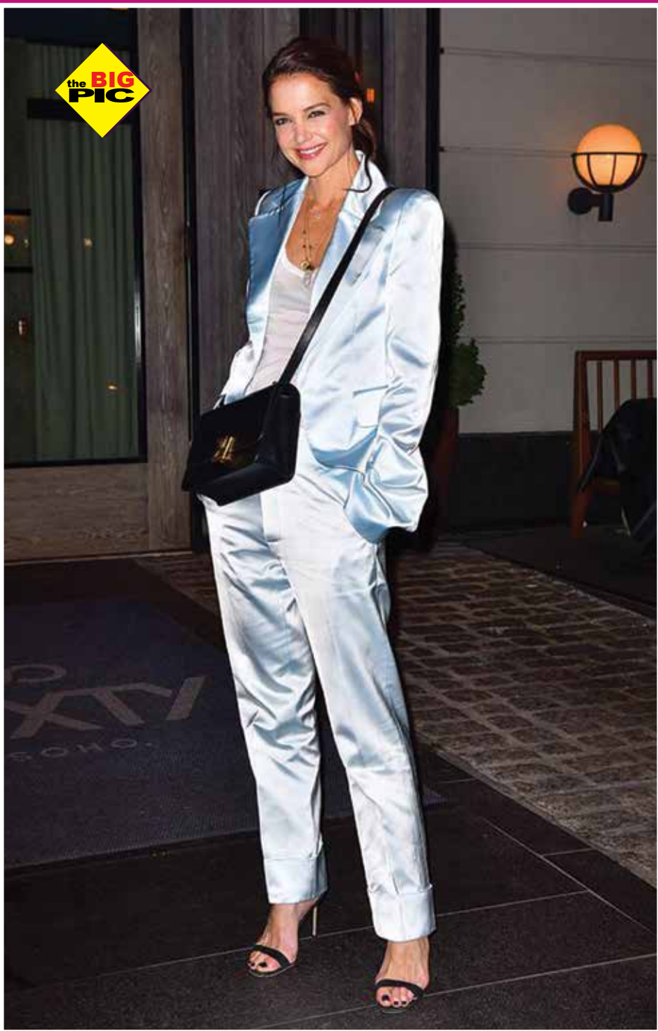
SHINE THROUGH THE NIGHT! Actress Katie Holmes is in good spirits at the Flaunt and Zadig & Voltaire's celebration of The Home Issue: A Return honoring Katie Holmes in NYC.