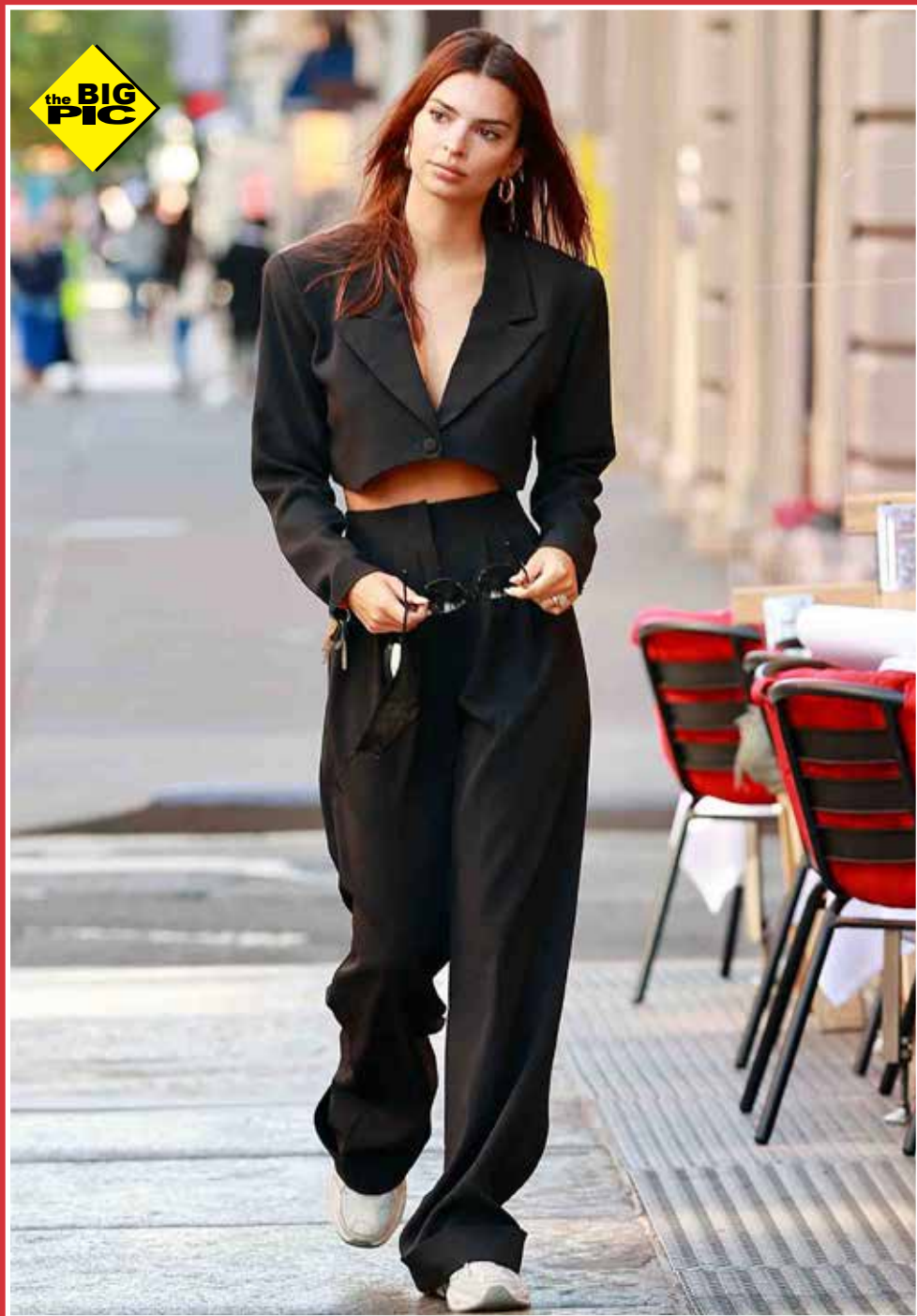
FIT AND FAB! Actress Emily Ratajkowski showed off her toned abs in Nasty Gal's cropped power suit in New York City.