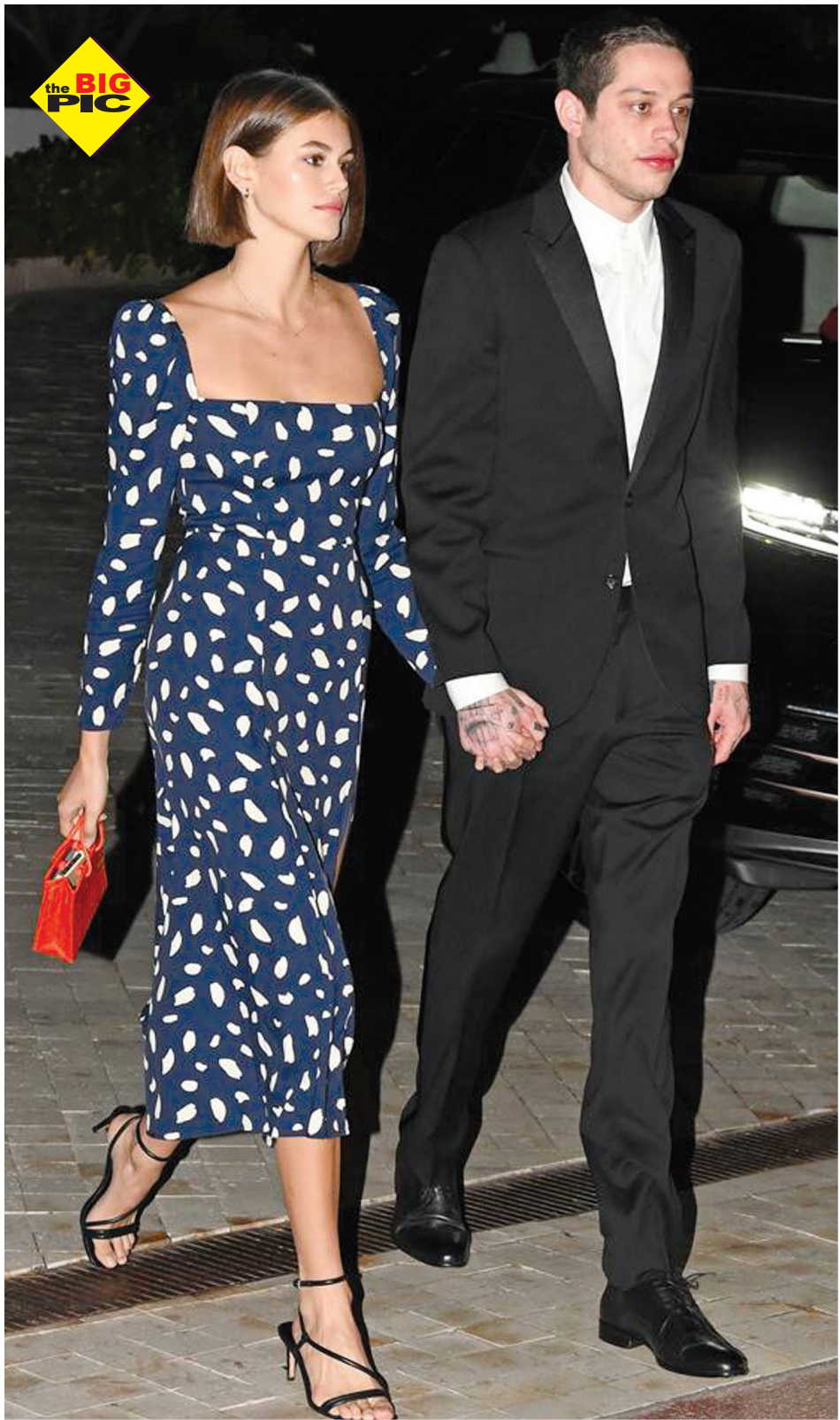
EFFORTLESSLY ELEGANT: Miami looks good on Pete Davidson and Kaia Gerber, who have been putting their blossoming romance on full display during their romantic getaway. After enjoying a beach-filled day and packing on the PDA for onlookers, the dynamic duo got dolled up on Saturday evening to attend a friend’s wedding