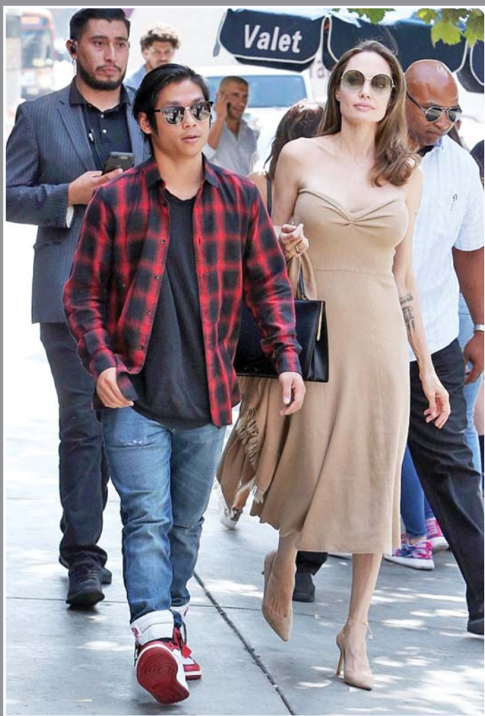
MOM & ME TIME! Angelina Jolie stepped out with son Pax, 14, in Los Angeles as the two enjoyed lunch together and a spot of shopping.