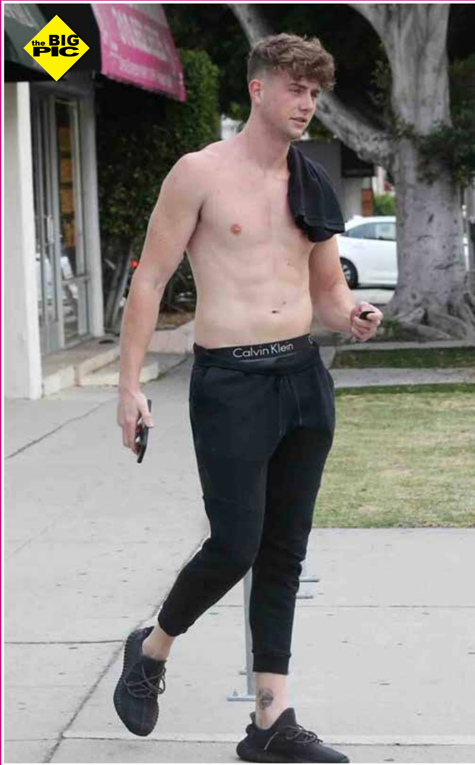
POST WORKOUT! The reality tv star, Harry Jowsey is out and about shirtless after a workout session.