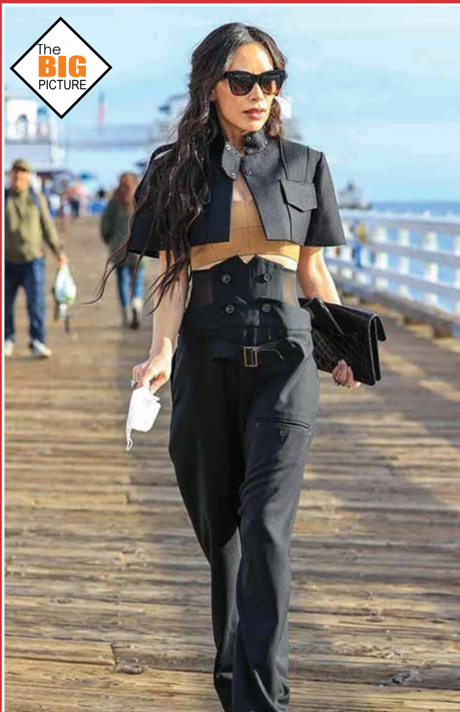
BOARDWALK STRUT! The Bling Empire star, Christine Chiu looks fierce in a black and brown outfit after enjoying lunch in Malibu.

In 2019, Fonda made headlines for her participation in the climate change protests in Washington DC, wherein she was arrested on multiple occasions.