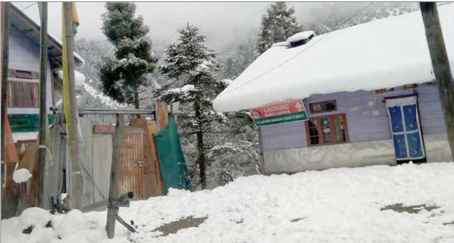
HOUSES draped in snow in Lachung, North Sikkim, on Monday.