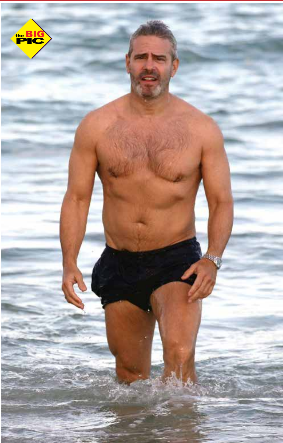
BEACH BOD! Television show host, Andy Cohen showed off his pumped-up physique on the beach in Miami.