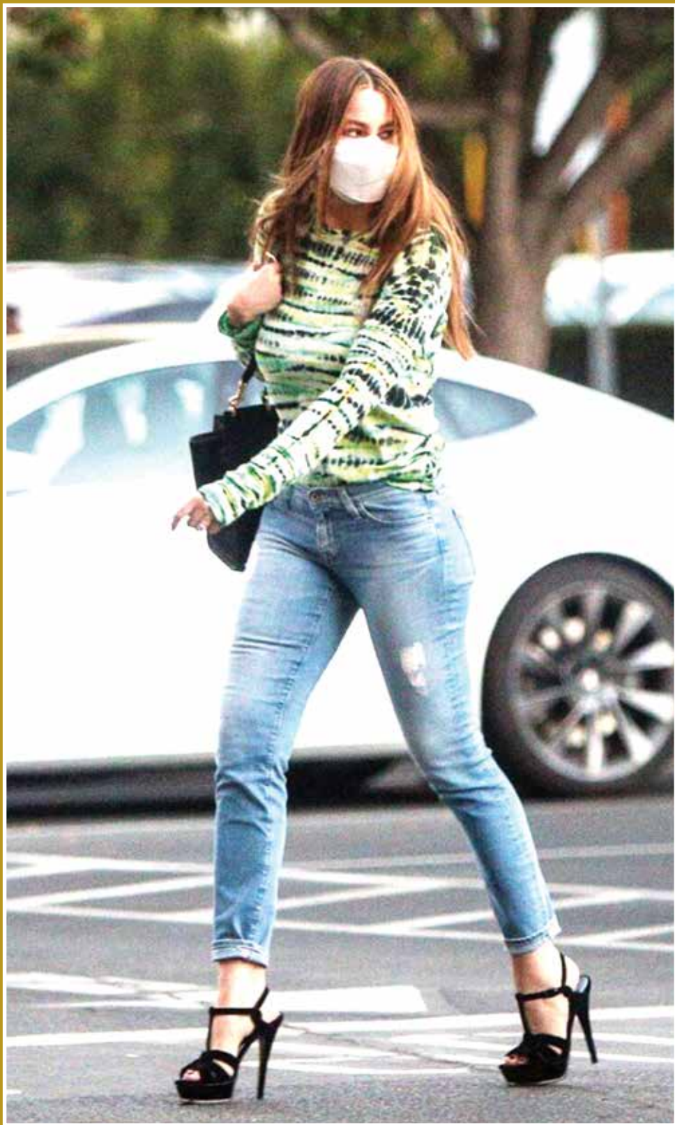
OMG, SHOES! The Modern Family star, Sofia Vergara displays her strong shoe game while out in Los Angeles.