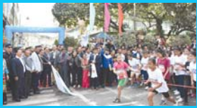
CM FLAGS OFF NAMCHI MARATHON pg02