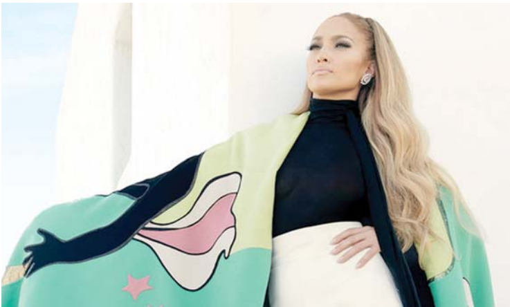
the media in her "Jenny From the Block" video.

In the December issue of InStyle (on newsstands Nov. 9), the 49-year-old Second Act actress ruminates on how dating in Hollywood has changed since the dawn of social media. Take, for example, Lopez's high-profile relationship with Ben Affleck, which ended in 2004. The extensive media coverage surrounding their romance was intense, but the former couple fed into it by doing joint interviews and lambasting