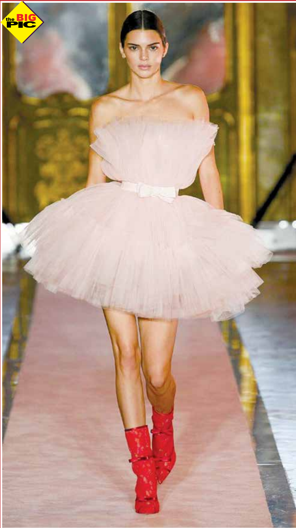
TULLE TIME! The model, Kendall Jenner rocks a super feminine mini dress on the runway in Italy.