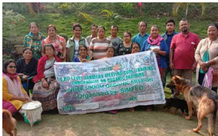
FARMER'S TRAINING PROGRAMME: Today a GPU level farmer's training on organic agriculture management was held at Mellidara Paiong, South Sikkim on pest & Management. Programme was attended by Pan-chayat Member, CEO Melli Dara, FIG President, ICS Staff & Progressive farmers.

"I won't give up the fight for human rights, peace, freedom and democracy for the rest of my life, no matter the danger, discrimination and retaliation I will face, and no matter how my reputation will be stained," he wrote.