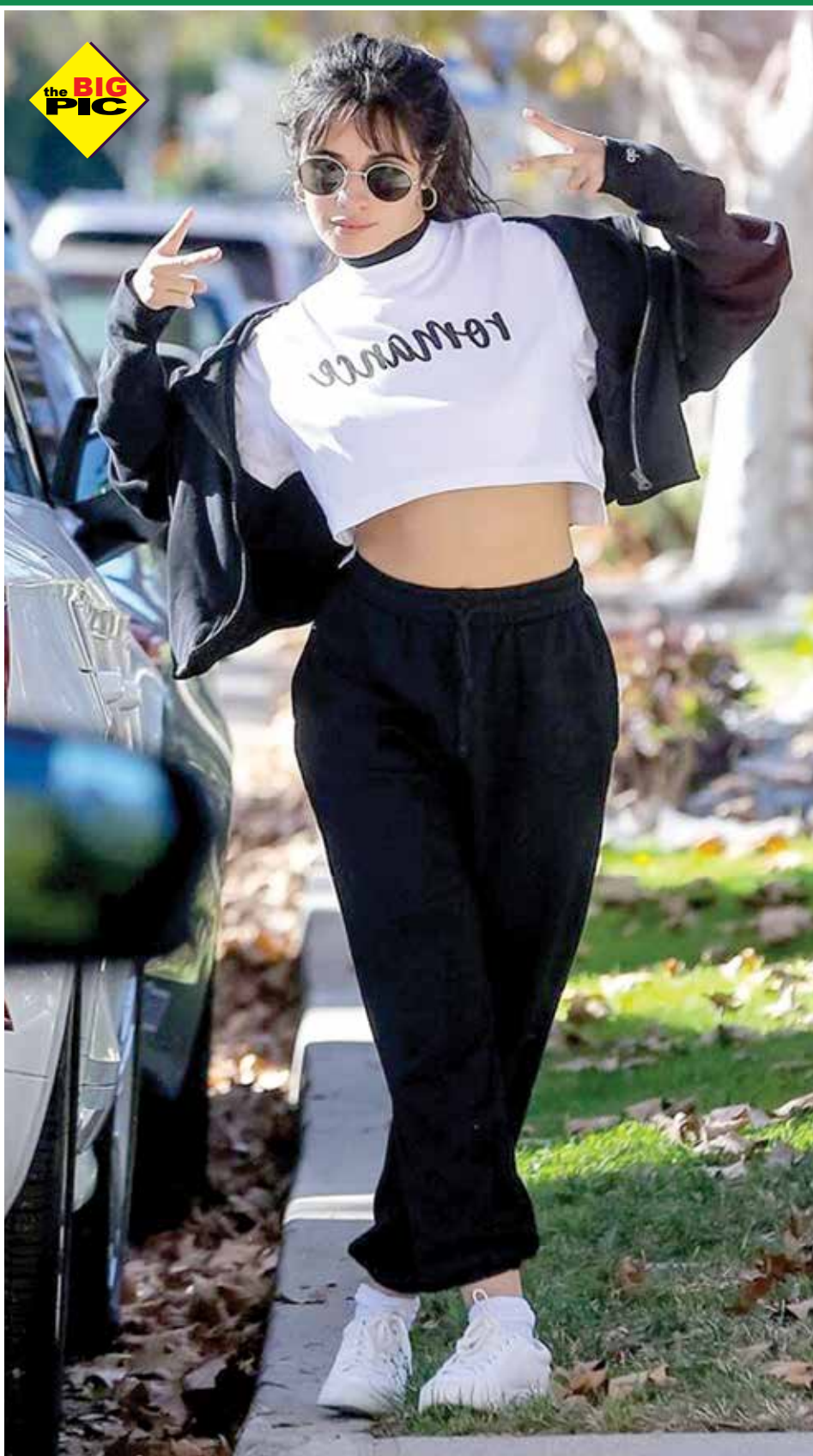
GOOD VIBES! The singer, Camila Cabello steps out for lunch with her mom and friends in Los Angeles while rocking a Romance shirt to promote her latest album.