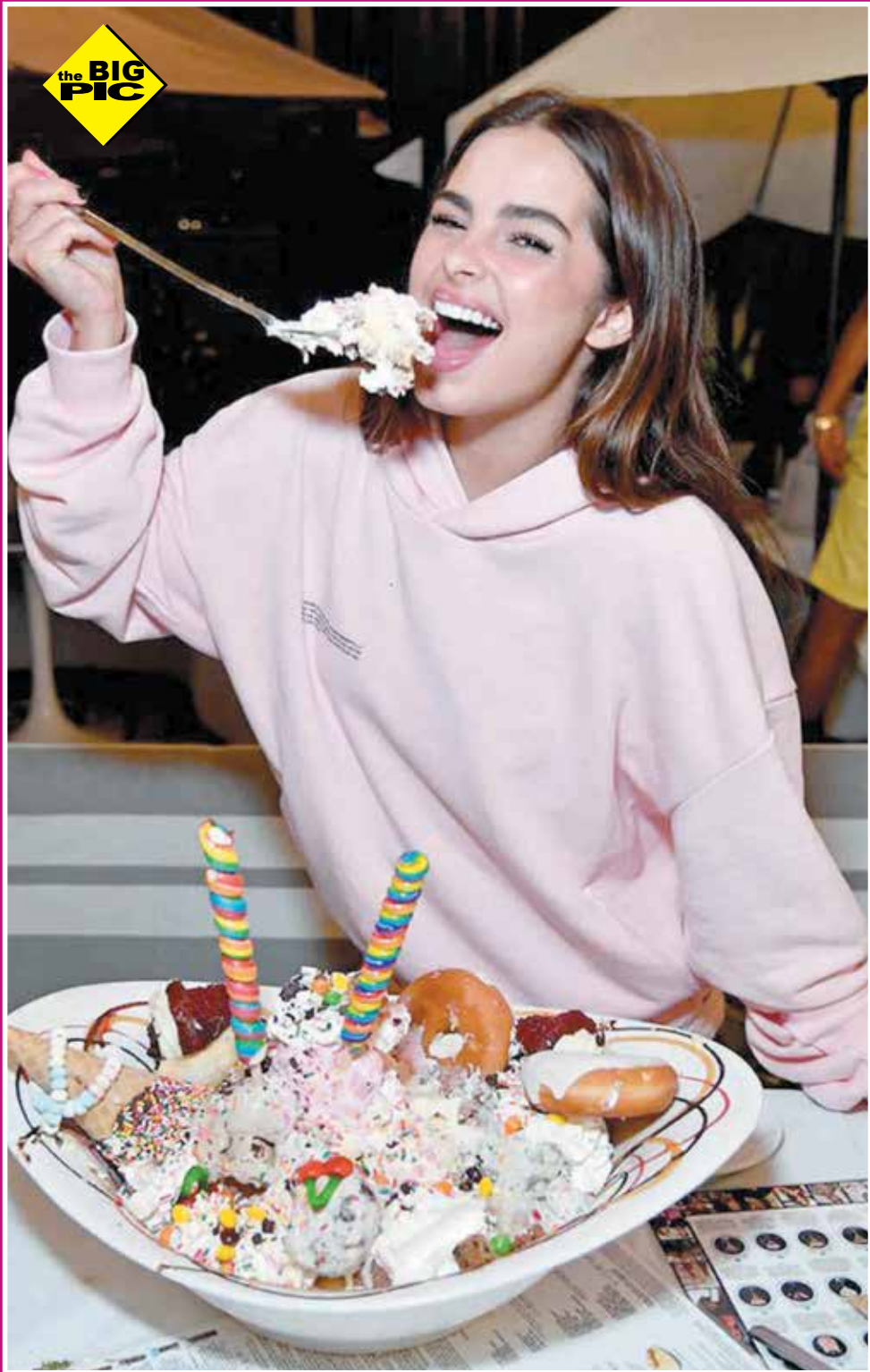
SWEET! The TikTok star, Addison Rae celebrates her brother's 7th birthday with a King Kong Sundae at Sugar Factory Westfield Century City in LA.