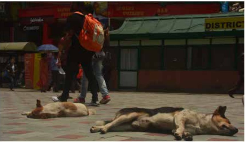
A 25-year-old government has changed, but for some, nothing much. Friday morning on MG Marg.

SPCC has reiterated its commitment to ensure protection of Sikkim’s interests and sincerely hopes that the new government in Sikkim will always work without compromising the interests of Sikkim and its people.