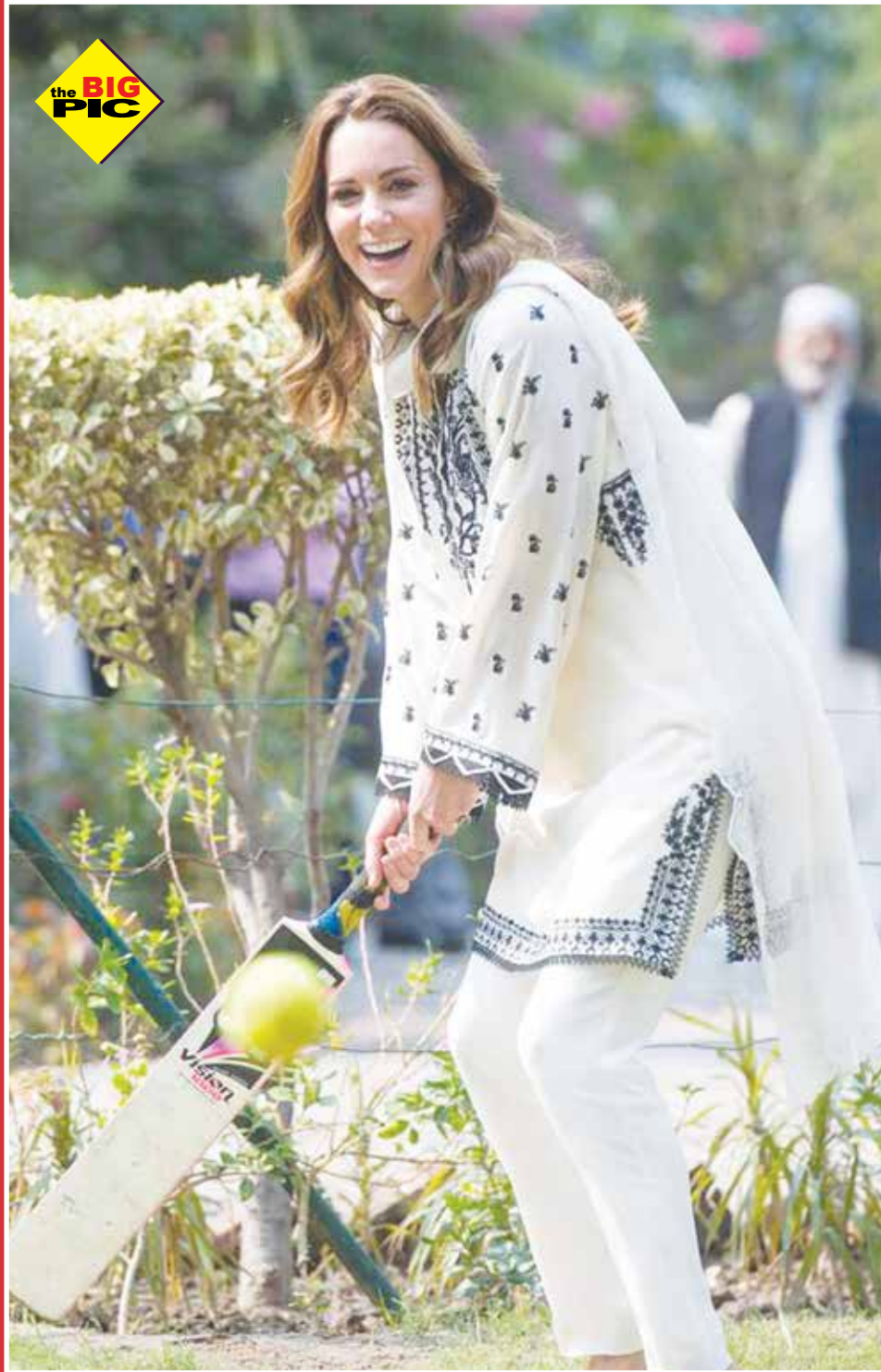
GAME ON! The Duchess of Cambridge, Kate Middleton plays a game of cricket while visiting SOS Children's Village in Lahore, Pakistan.