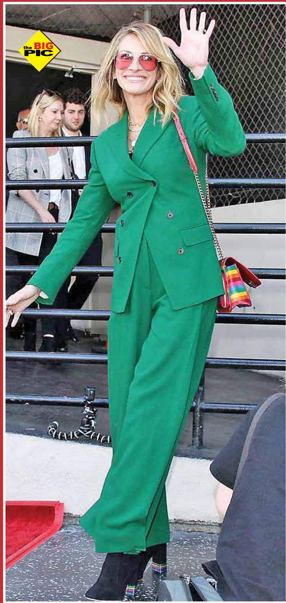
SUPPORTIVE FRIEND! Actress Julia Roberts waves to fans while supporting Rita Wilson, as she gets her star on the Hollywood Walk of Fame.

"He was hot s*** and he believed in me. It's a little bit of a love letter to him because I have grown with this person," she had written in the book in a chapter dedicated to Sandler, titled 'Adam'.