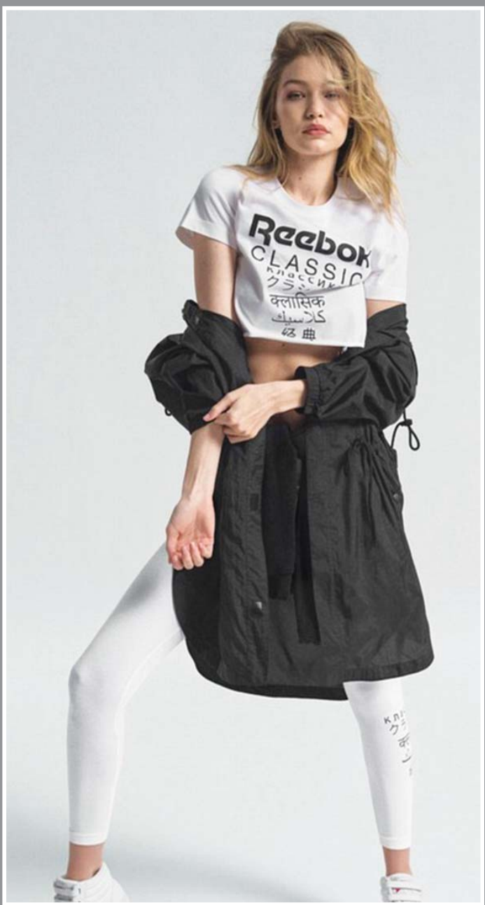
BLONDE BOMBSHELL! Gigi Hadid, 23, dressed in a Reebok classic crop top and skin-tight white leggings, flaunted her fit frame in #bemorehuman Reebok campaign.