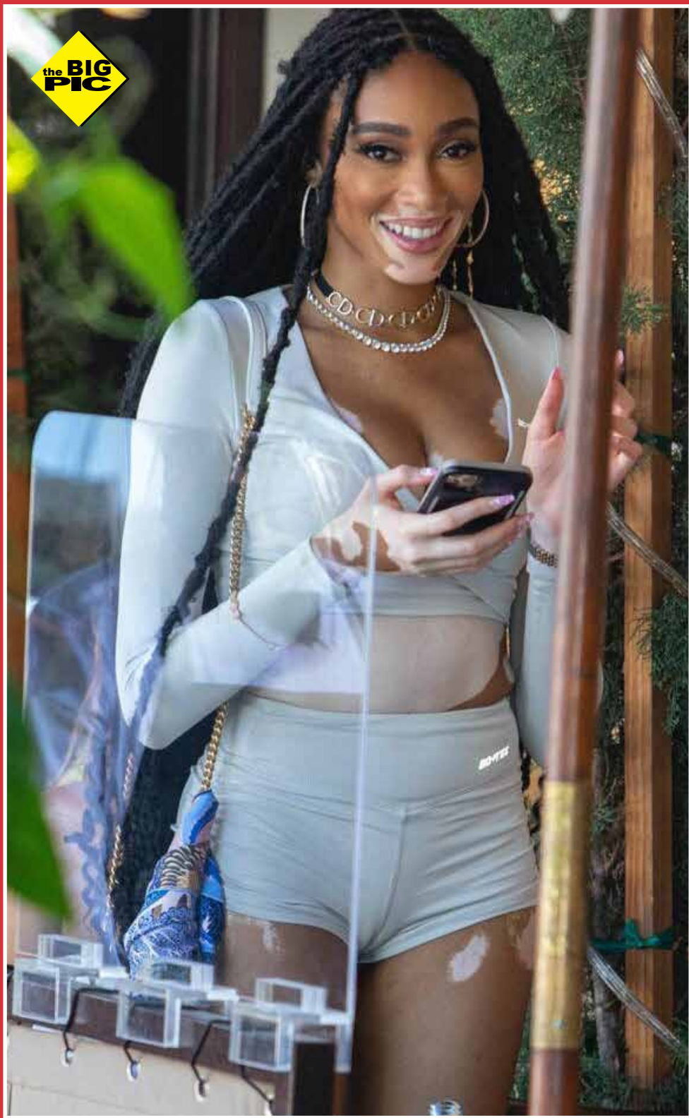
GLOWING! Canadian model, Winnie Harlow America's Next Top Model is out to lunch with some friends.