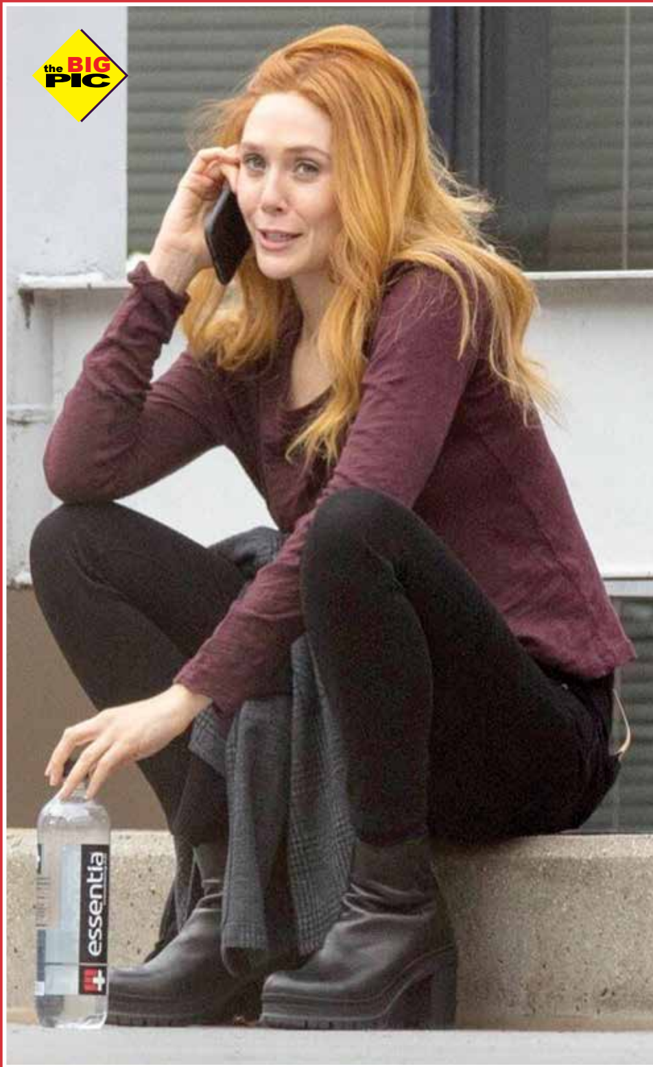
ON HER CELL PHONE! The Marvel actress, Elizabeth Olsen who plays, Wanda Maximoff for upcoming Disney+ miniseries, Wandavision is dressed up as her character Scarlett Witch and on set in Atlanta.